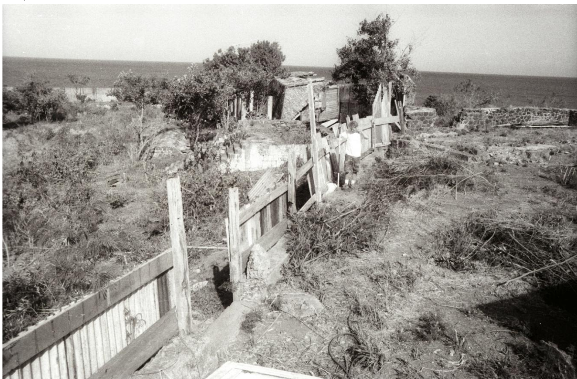
Figure 100.—Modern fence constructed on top of stone wall enclosing the Northeast Bastion (to the right); Structures 36 and 37 show at rear center; Structure 1 visible to the right, view to northwest.