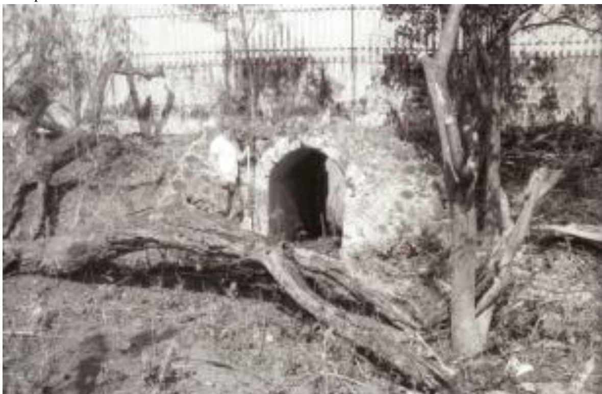
Figure 74.—Structure 29, Sally Port, east or interior opening, view to the west; note steel picket security fence attached to defensive wall.