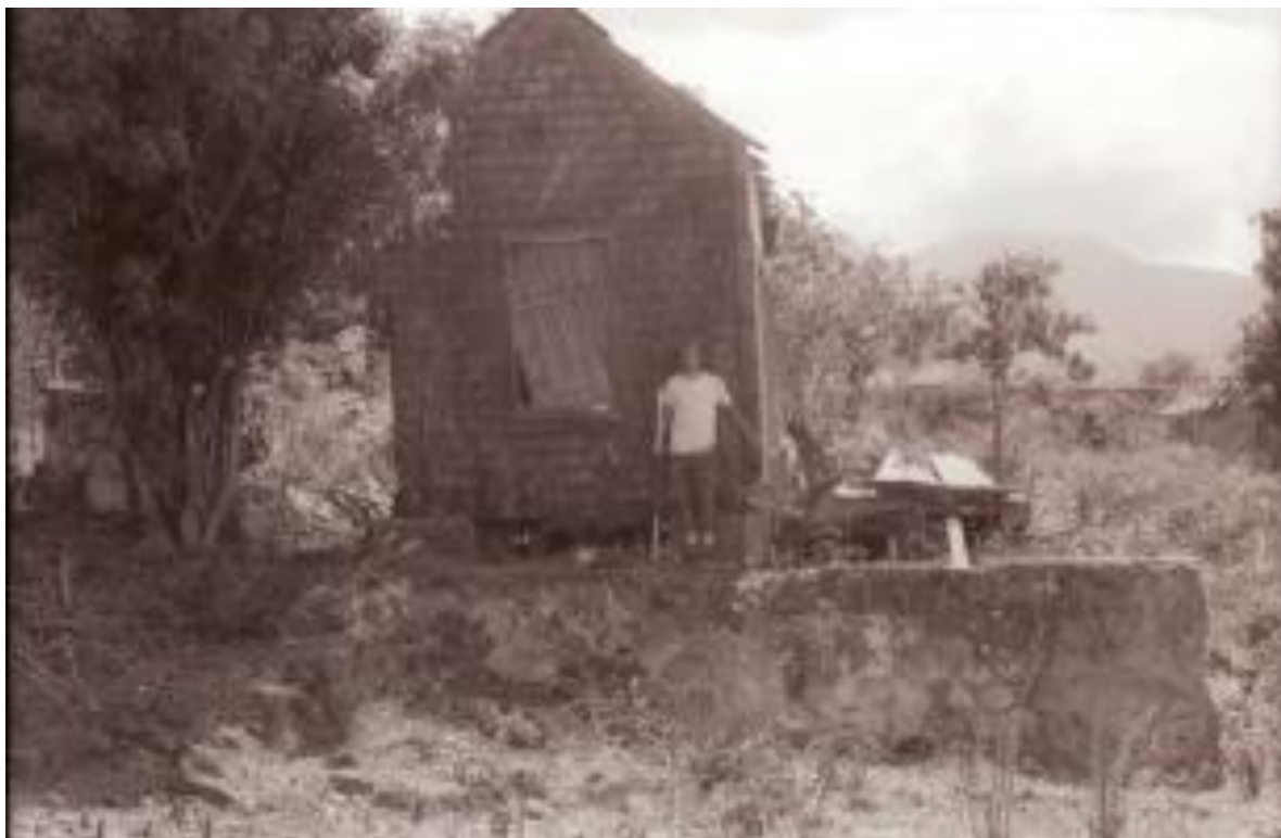
Figure 85.—Structure 34, Patient Living Quarters ruins, west elevation; west cistern catchment retaining wall in foreground.