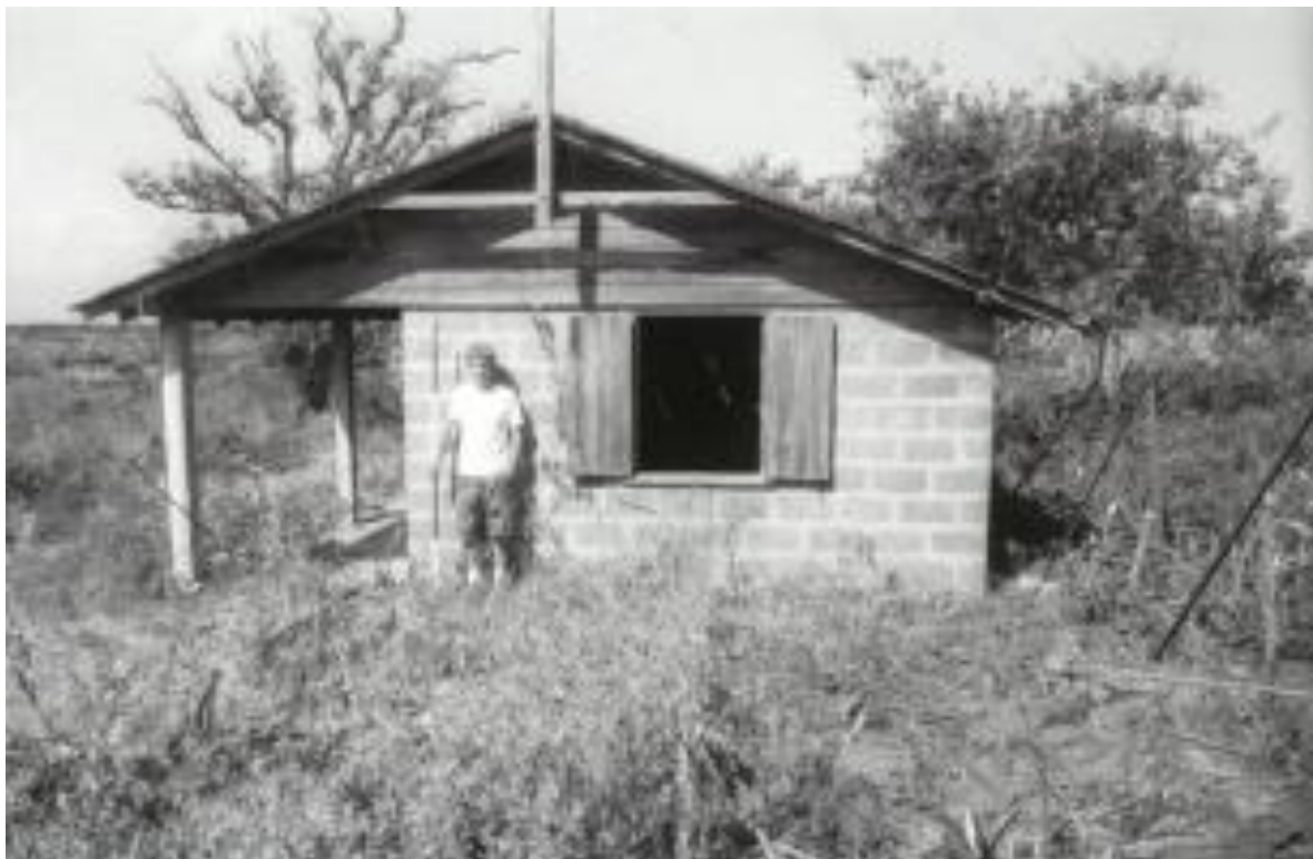
Figure 30.—Structure 9, Clinic, east elevation.