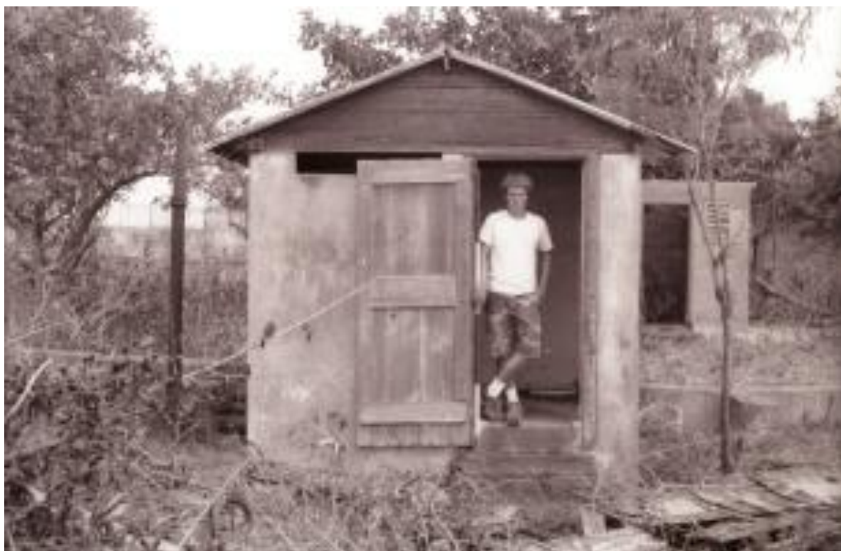
Figure 65.—Structure 24, Bathroom, south elevation; Structure 28 shows in right background.