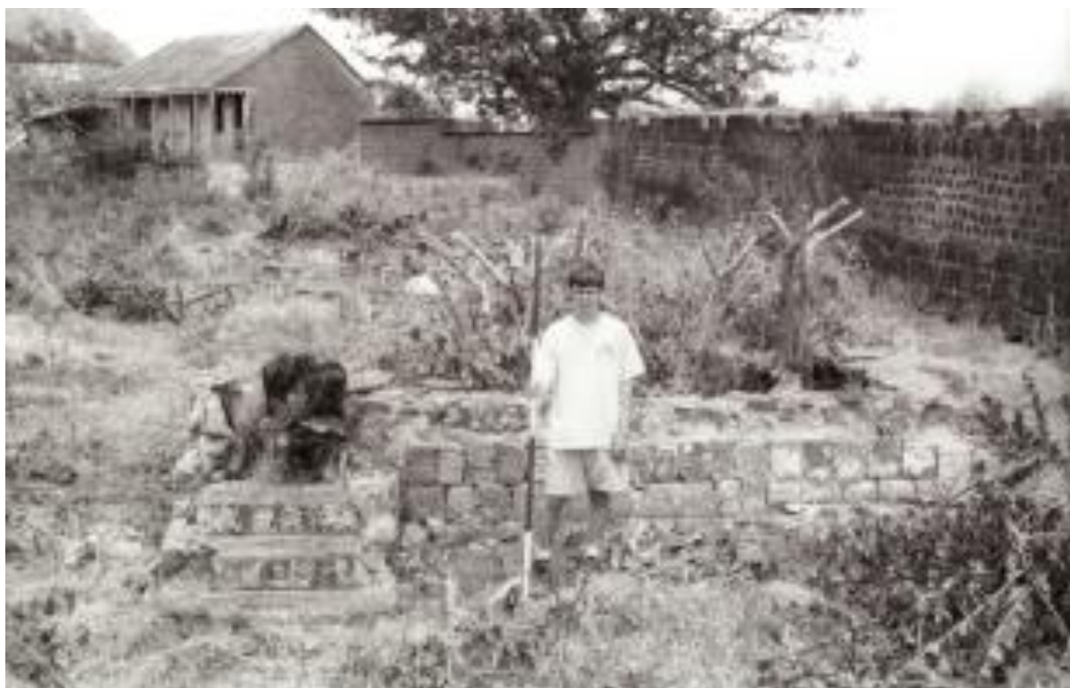
Figure 59.—Structure 20, Stone Foundation, south elevation.