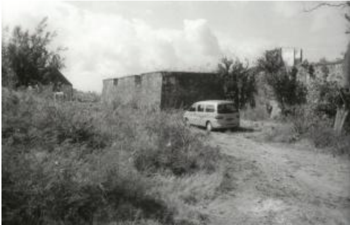
Figure 5.—Southeast Bastion, view southwest