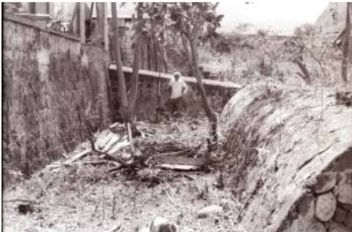
Figure 87.—Structure 35, Cistern and catchment area, showing retaining wall to the left and rear, view to east.