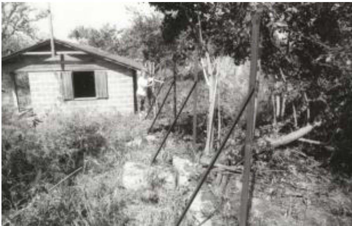
Figure 99.—Fence line consisting of concrete base and steel posts dividing asylum grounds, Structure 9 at rear, view west.