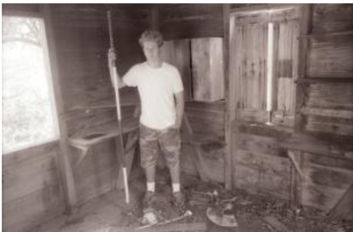
Figure 36.—Structure 10, Pharmacy, interior, note built in shelves and counter, view to east-northeast.