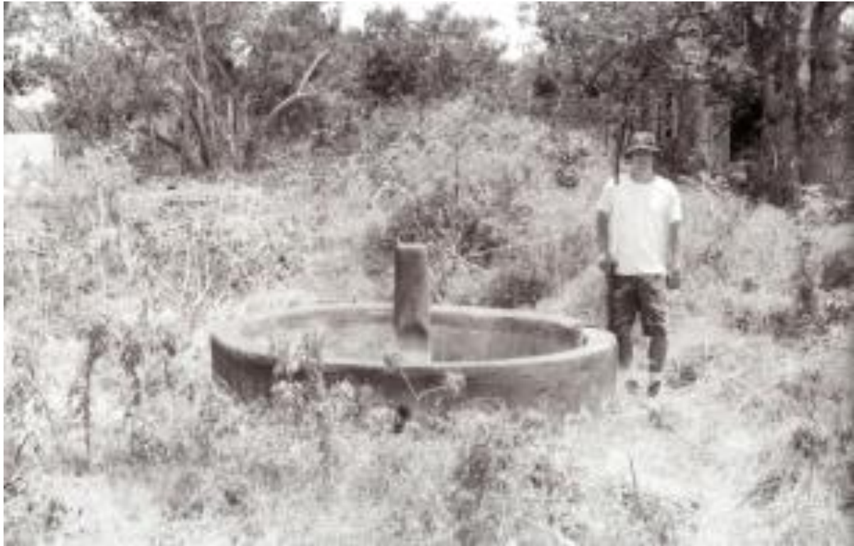
Figure 63.—Structure 23, Fountain, view to north; Structure 10 shows at right rear.