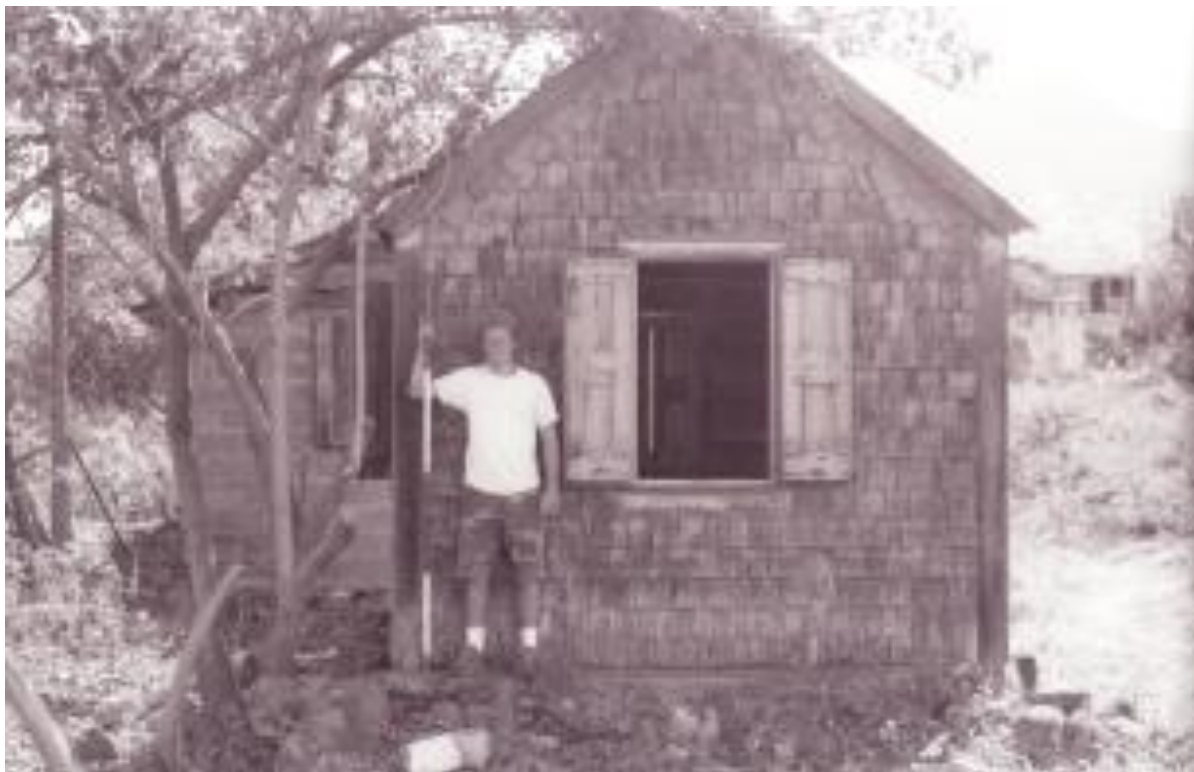
Figure 34.—Structure 10, Pharmacy, west elevation.