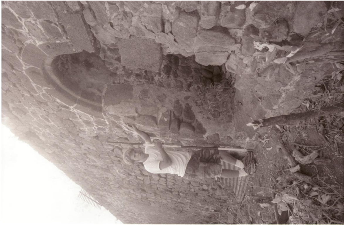
Figure 75.—Structure 29, sally Port, west or exterior opening.