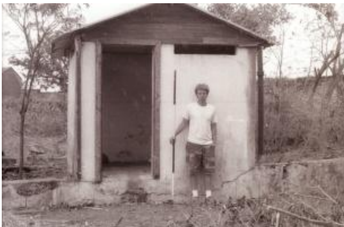
Figure 66.—Structure 24, Bathroom, north elevation; note attachment of concrete fence foundation at both corners.