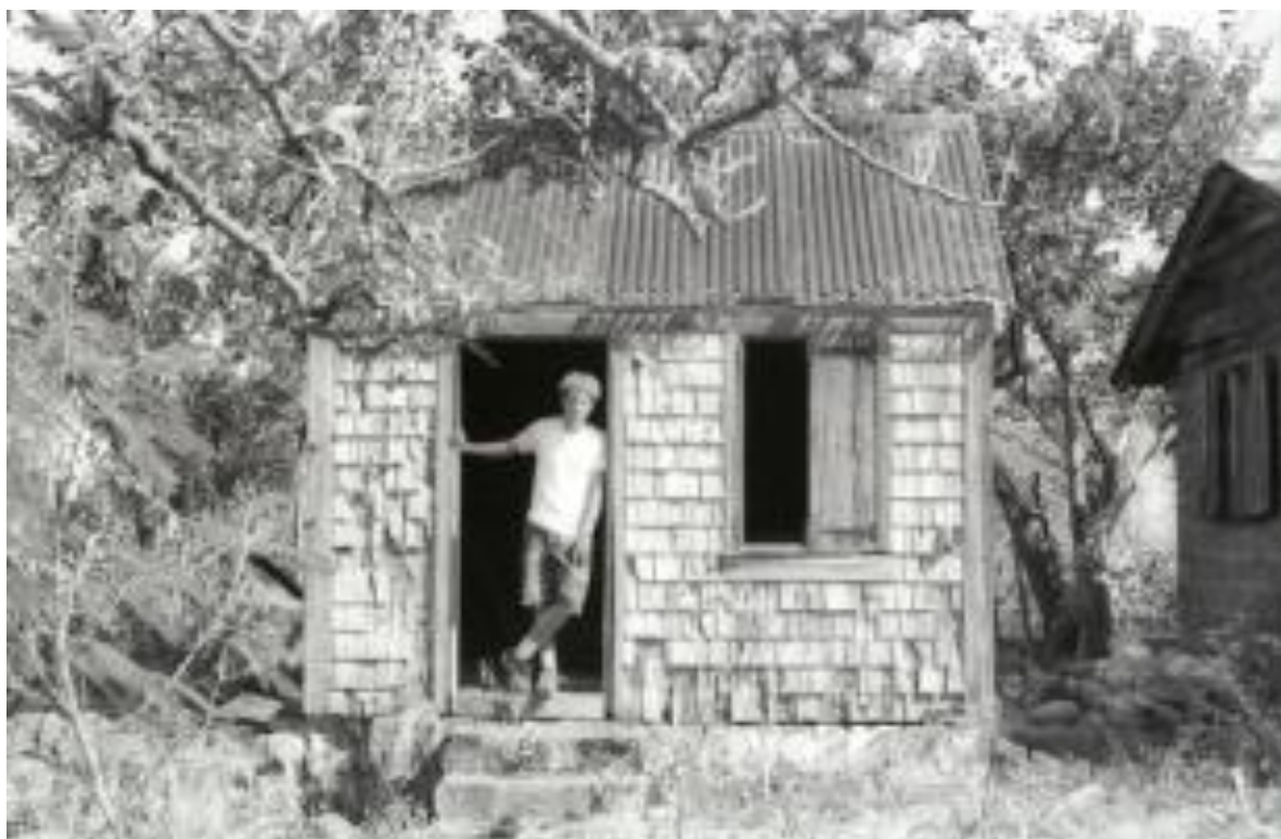
Figure 35.—Structure 10, Pharmacy, north elevation, note concrete fence foundation in foreground.