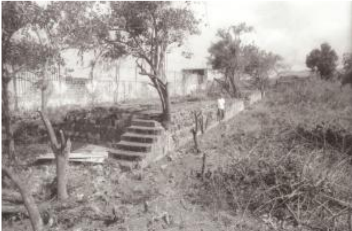
Figure 77.—Structure 30, Stone Foundation, southeast perspective; note defensive wall and steel picket security fence at rear.