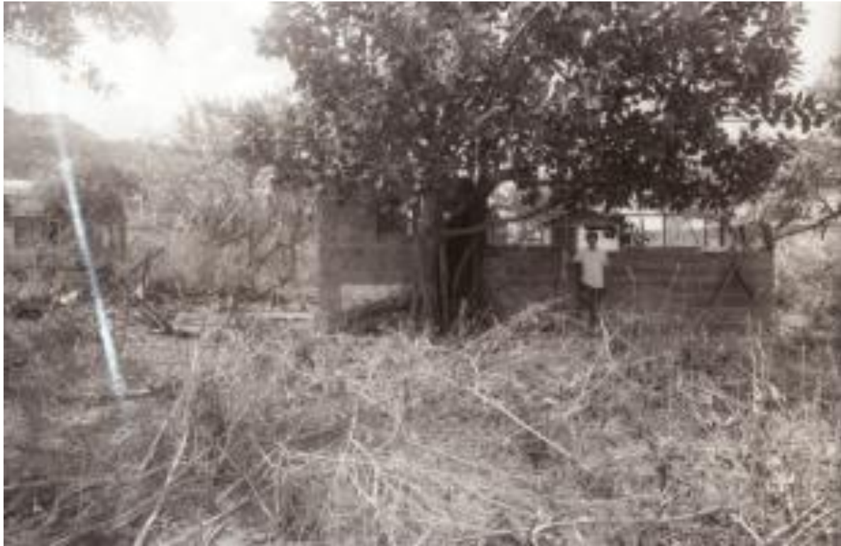
Figure 71.—Structure 28, Bath and Laundry Building ruins, north elevation