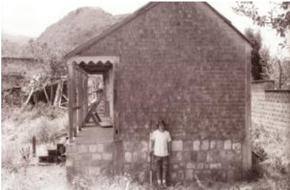
Figure 54.—Structure 18, Patient Living Quarters, north elevation; note concrete support piers filled in between with cut stones; concrete retaining wall to right, Structure 16 left rear; Brimstone Hill in background.