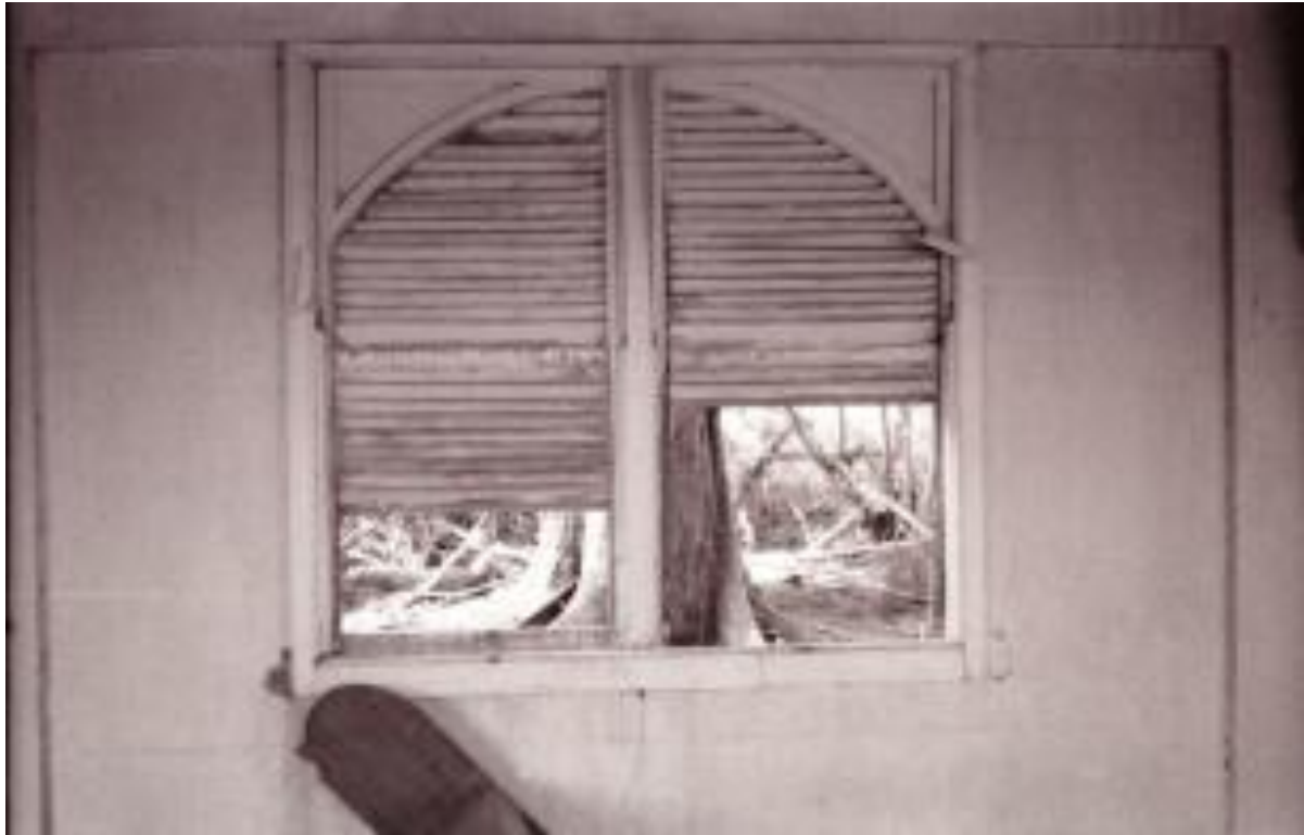
Figure 97.—Structure 38, Chapel, interior detail of louvered window.