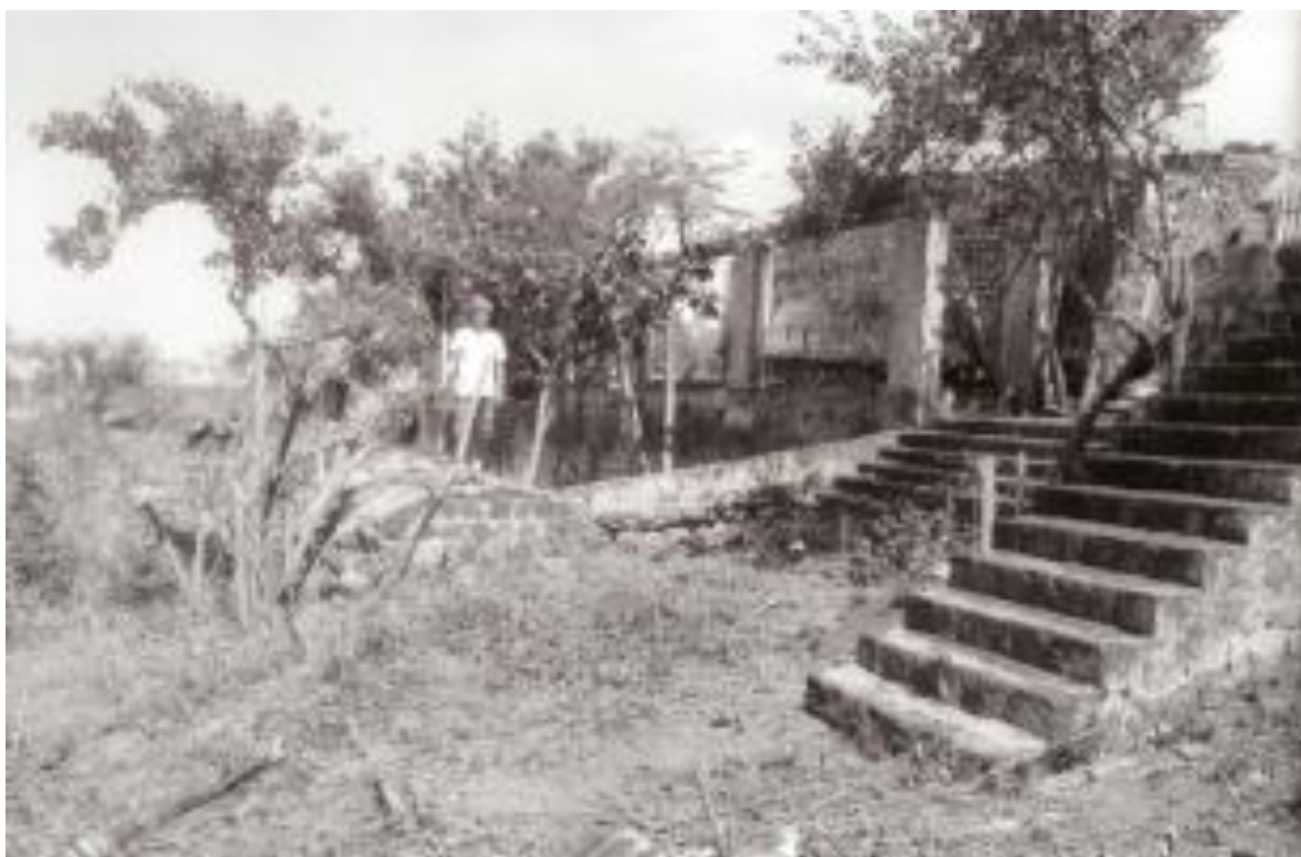
Figure 88.—Relationship of Structure 35 (left), Structure 36 (center) and Structure 37 (far right).