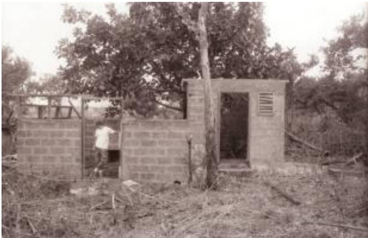
Figure 72.—Structure 28, Bath and Laundry Building ruins, south elevation; laundry is to the left, bath is to the right.