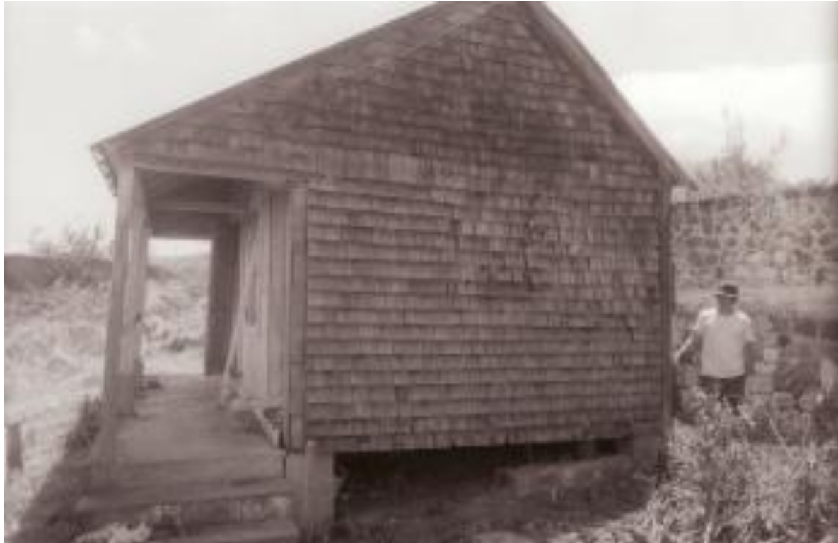
Figure 41.—Structure 12, Patient Living Quarters, west elevation.