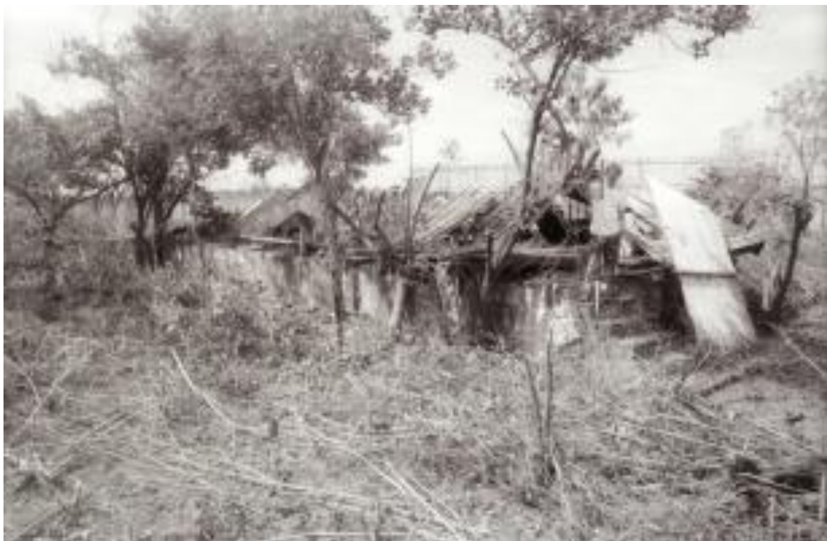
Figure 69.—Structure 27, Patient Living Quarters ruins, northeast perspective