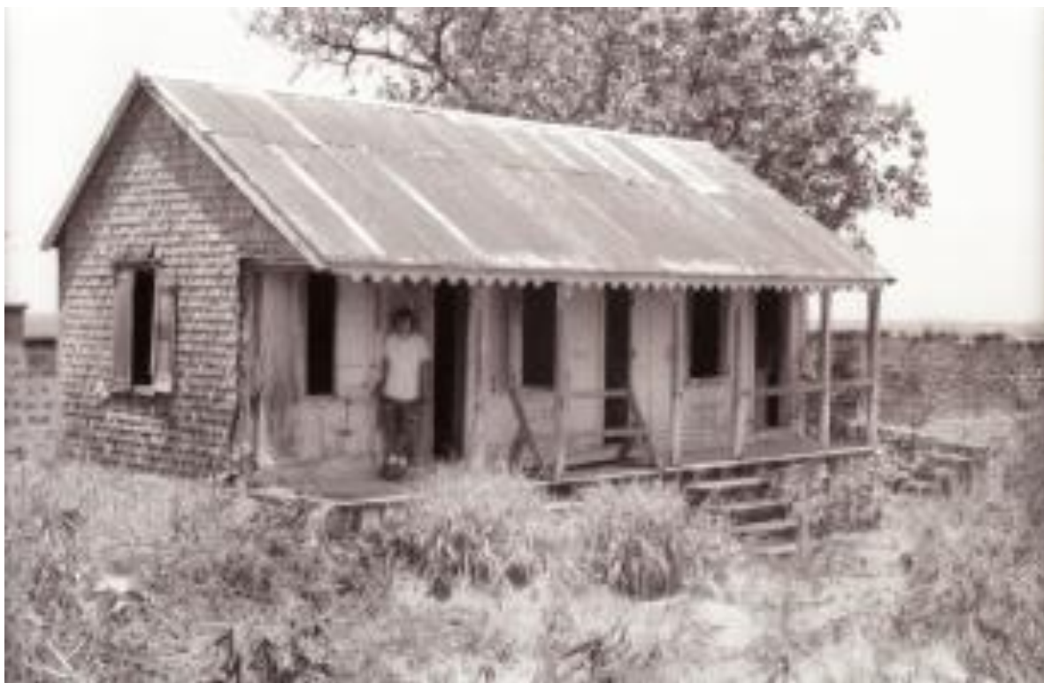
Figure 52.—Structure 18, Patient Living Quarters, southeast perspective, note decorative trim at top of porch and built in bench; Structure 19 shows to right with west defensive wall to rear.