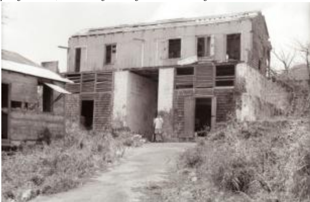
Figure 22.—Structure 7, Administrative Building, west elevation; built over Structures 5 and 6, and the fort's entrance passage; Structure 8 shows left foreground.