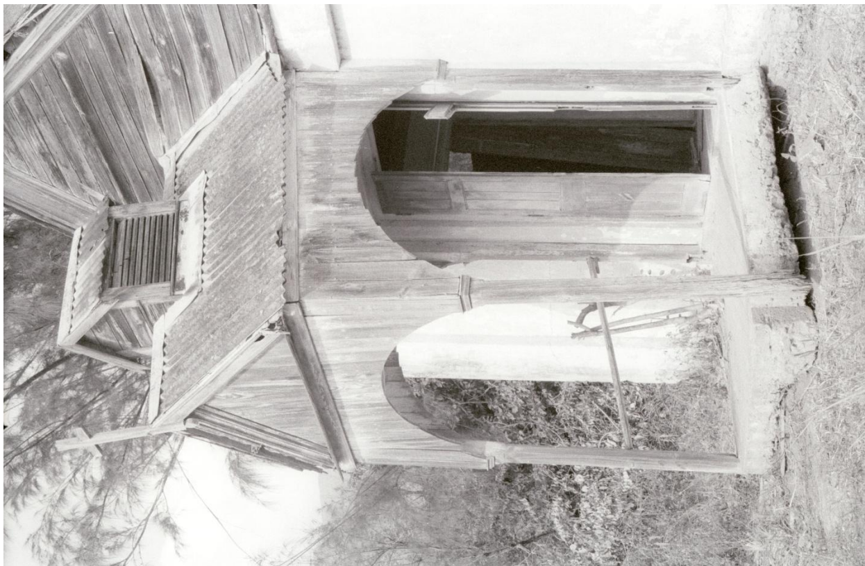
Figure 95.—Structure 38, Chapel, portico, northwest perspective; note cross and cupola.