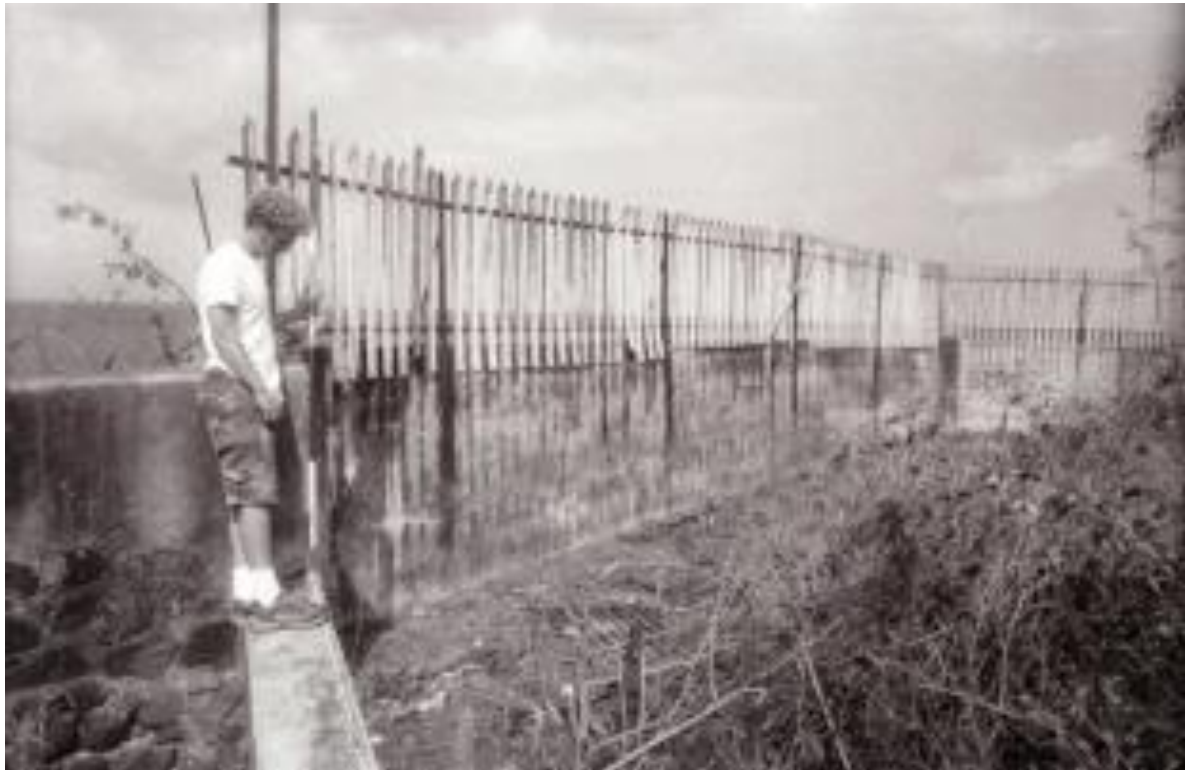
Figure 98.—Section of steel picket security fence atop west defensive wall; individual is standing on concrete fence foundation that runs from Structure 3 across the fort's interior and attaches to the west defensive wall (see Figure 99).