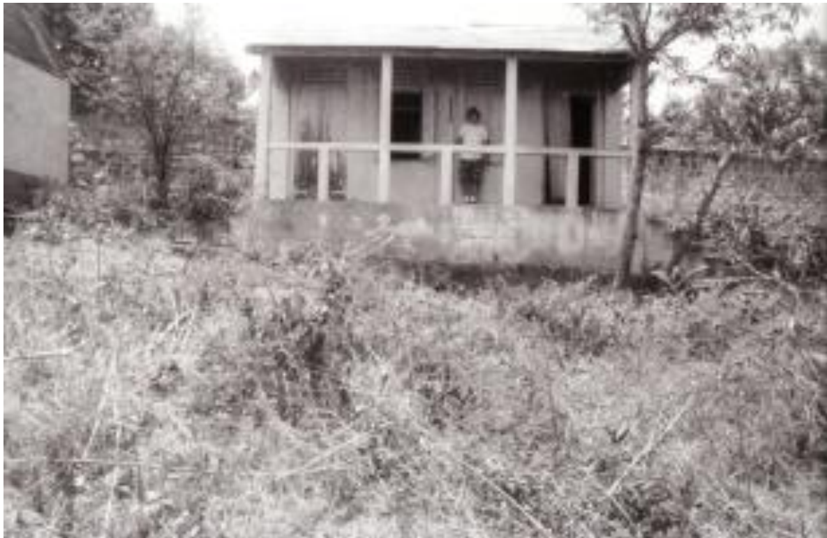
Figure 48.—structure 14, Patient Living Quarters, north elevation.