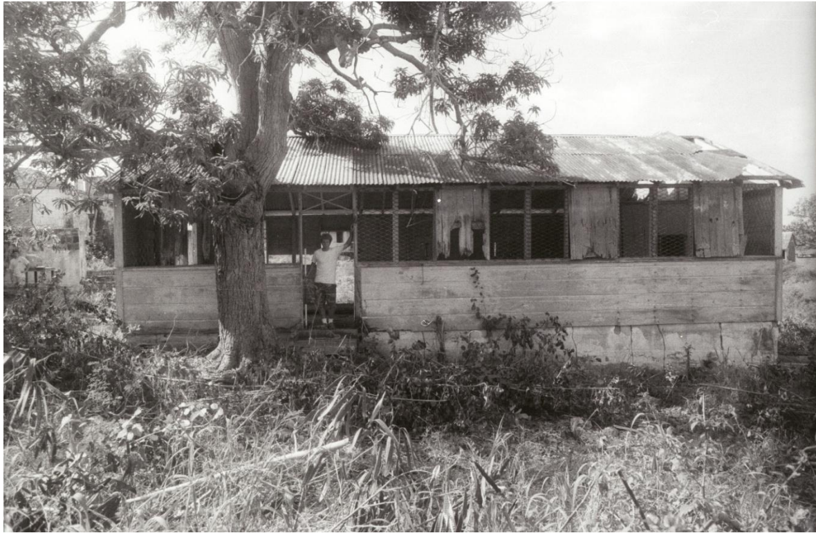
Figure 27.—Structure 8, Assembly Hall, north elevation.