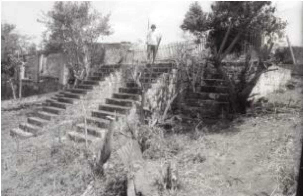
Figure 91.—Structure 37, Library, southeast perspective.