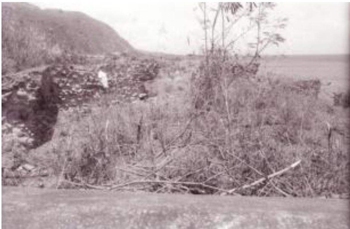
Figure 9.—Interior of the Southwest Bastion, view south