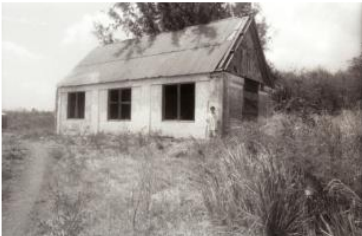
Figure 94.—Structure 38, Chapel, southwest perspective; note filled niche at the rear of the building.