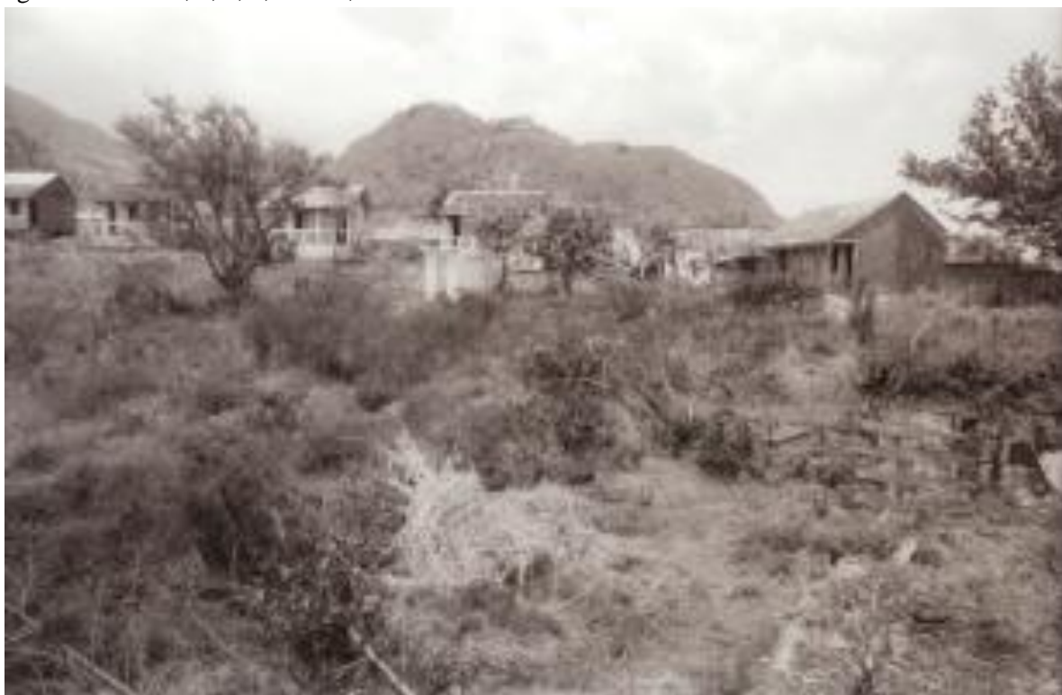
Figure 12.—Overall view of southern area of the fort's interior, from left to right, Structures 12, 13, 14, 15, 17, 16, 19, and 20, view to the south.