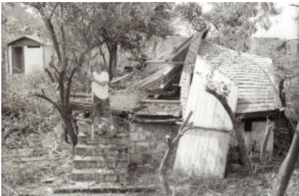
Figure 70.—Structure 27, Patient Living Quarters ruins, north elevation; Structure 24 shows left background.