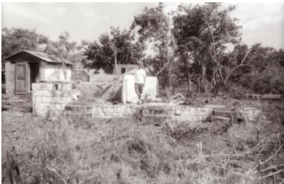
Figure 67.—Structure 25, Bath and Laundry Building ruins, south elevation; note three sets of steps; Structure 24 is to left and Structure 28 is center background.