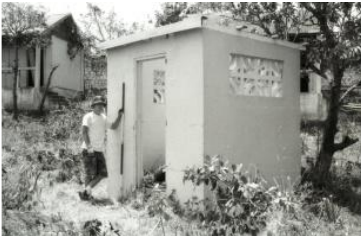
Figure 51.—Structure 17, Bathroom, northwest perspective, Structure 14 shows in left background