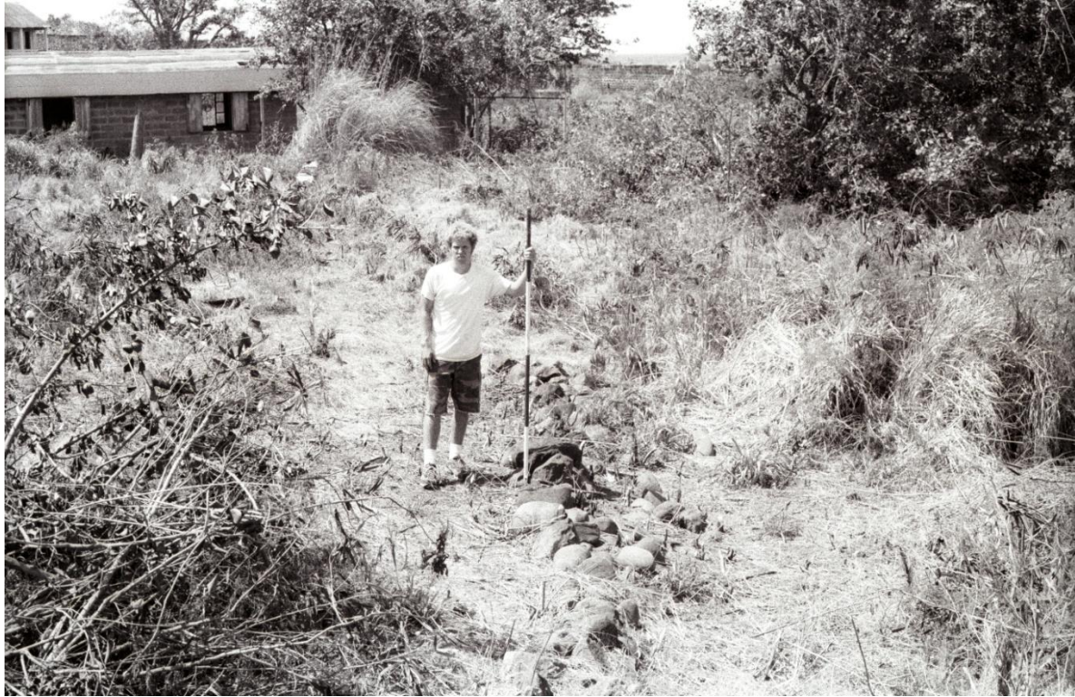
Figure 3.—Rock alignment south of Structure 35, view south (see Figure 2).