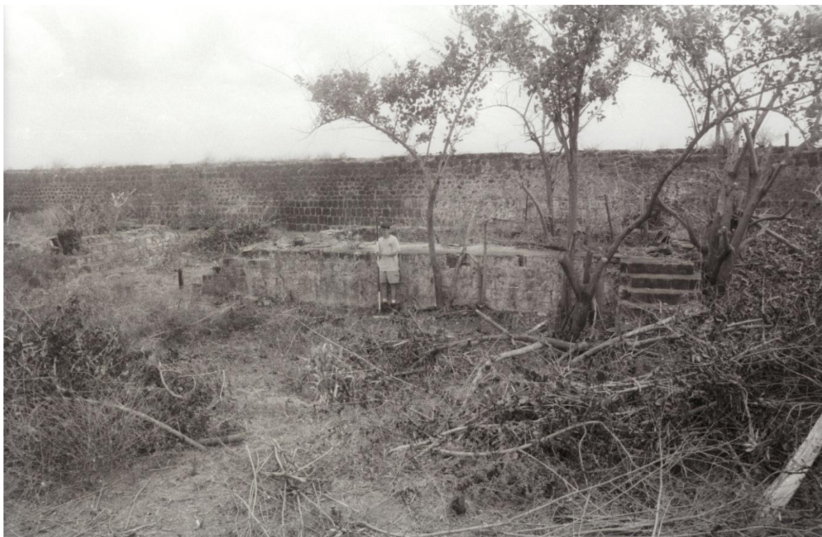
Figure 61.—Structure 22, Stone Foundation, east elevation.