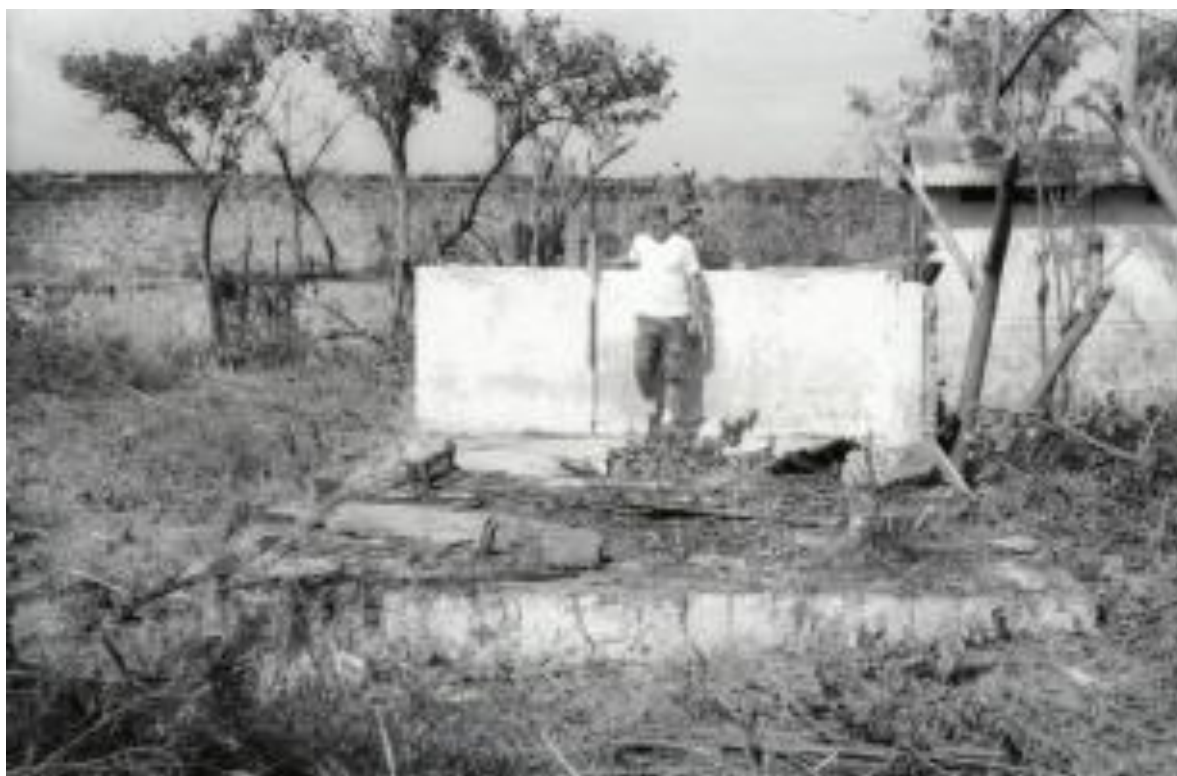
Figure 68.—Structure 25, Bath and laundry Building ruins, east elevation; Structure 24 shows right.