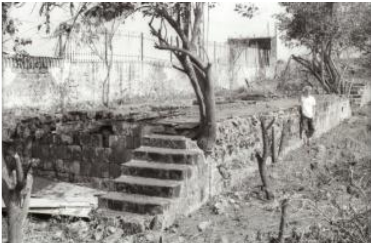
Figure 78.—Structure 30, Stone foundation, southeast perspective.