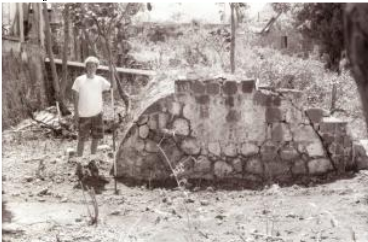
Figure 86.—Structure 35, Cistern and catchment area, west elevation; note stairway attached to structure's right side.