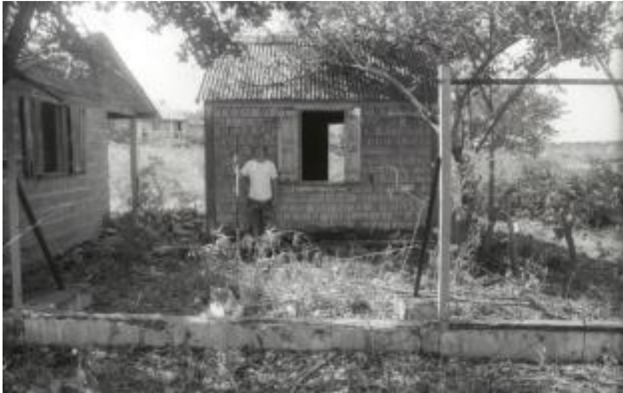
Figure 33.—Structure 10, Pharmacy, south elevation.