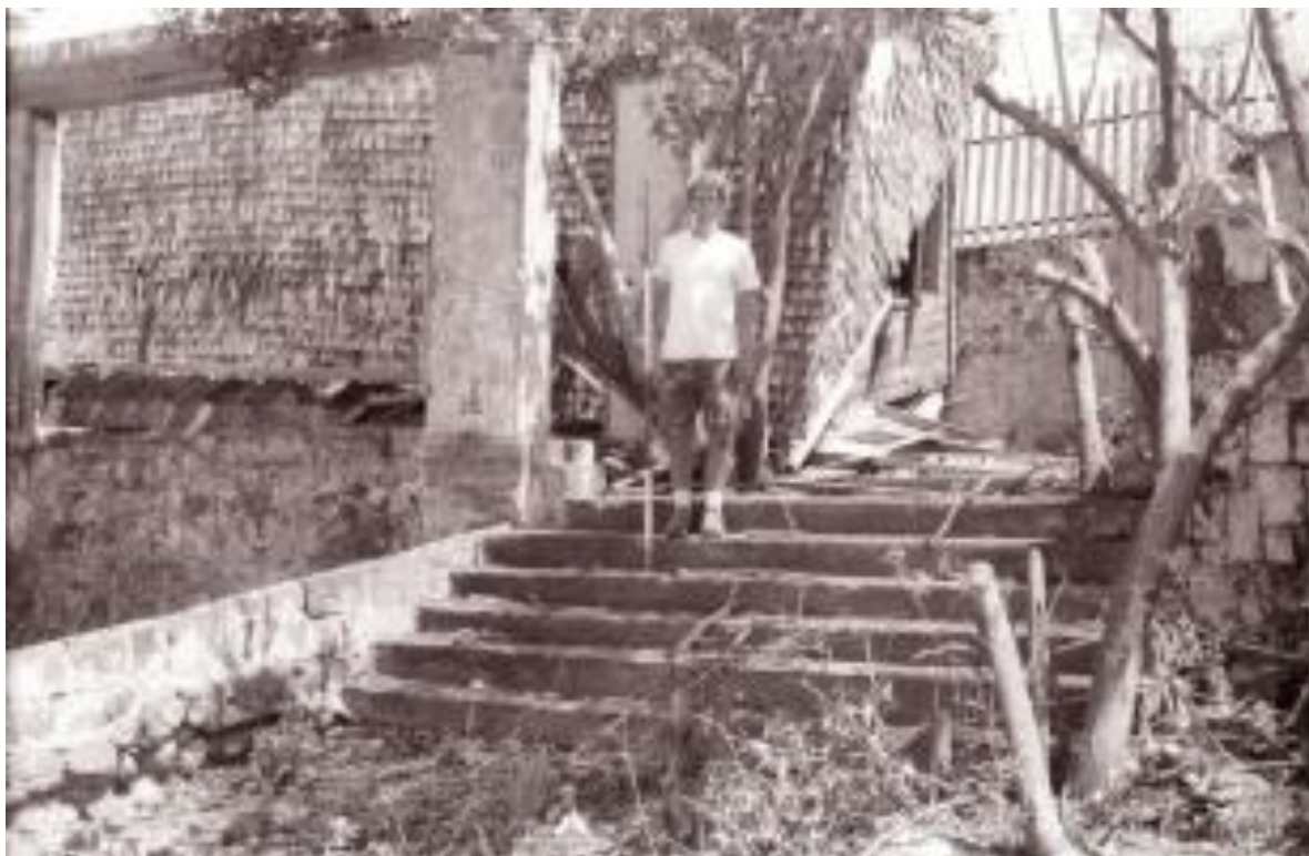
Figure 89.—Structure 36, Patient Living Quarters, southeast perspective and stairway between Structure 37 (at right) and cistern catchment retaining wall (at left).