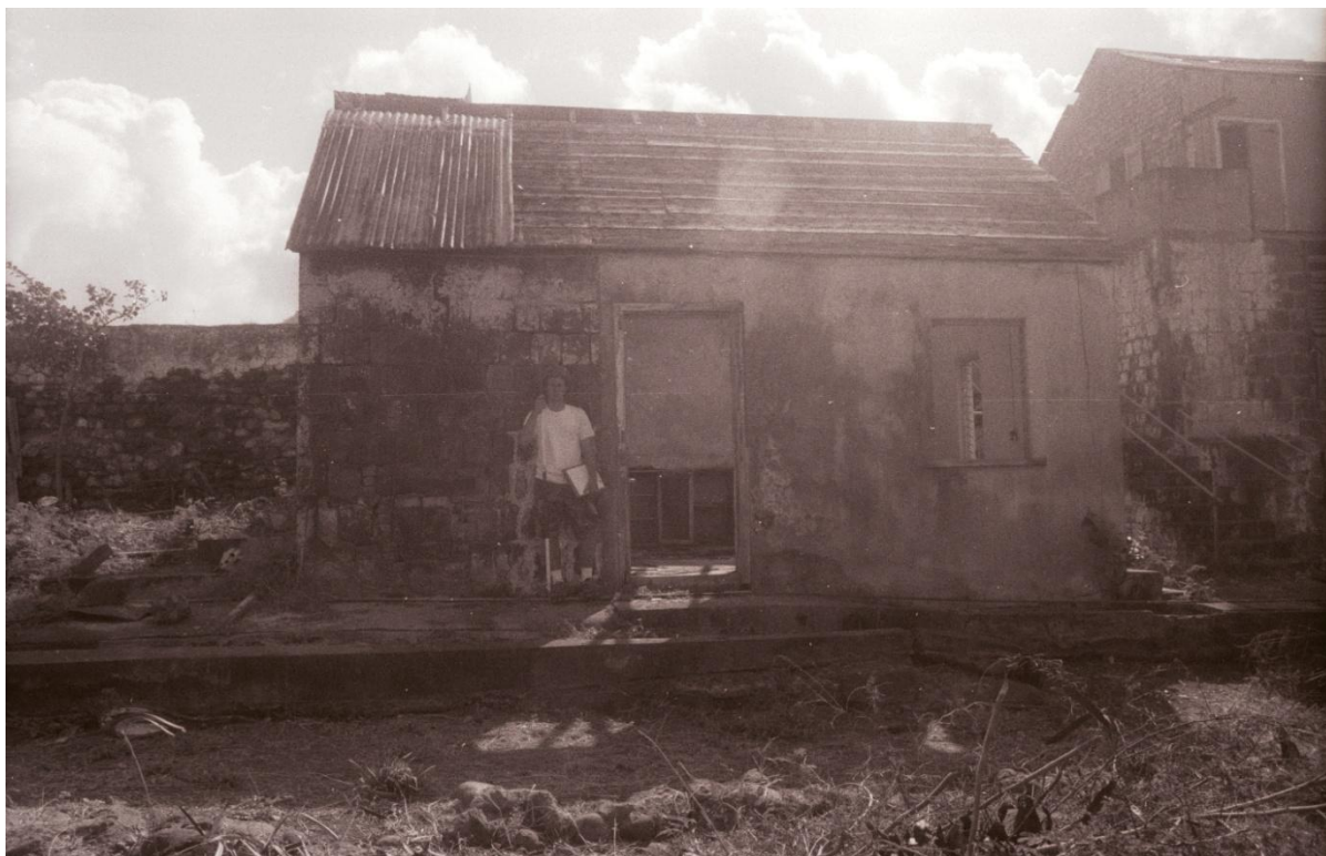
Figure 17.—Structure 4, Kitchen, west elevation, concrete walk and drain in foreground, note filled fireplace to left of person, Structures 5 and 6, rear right.