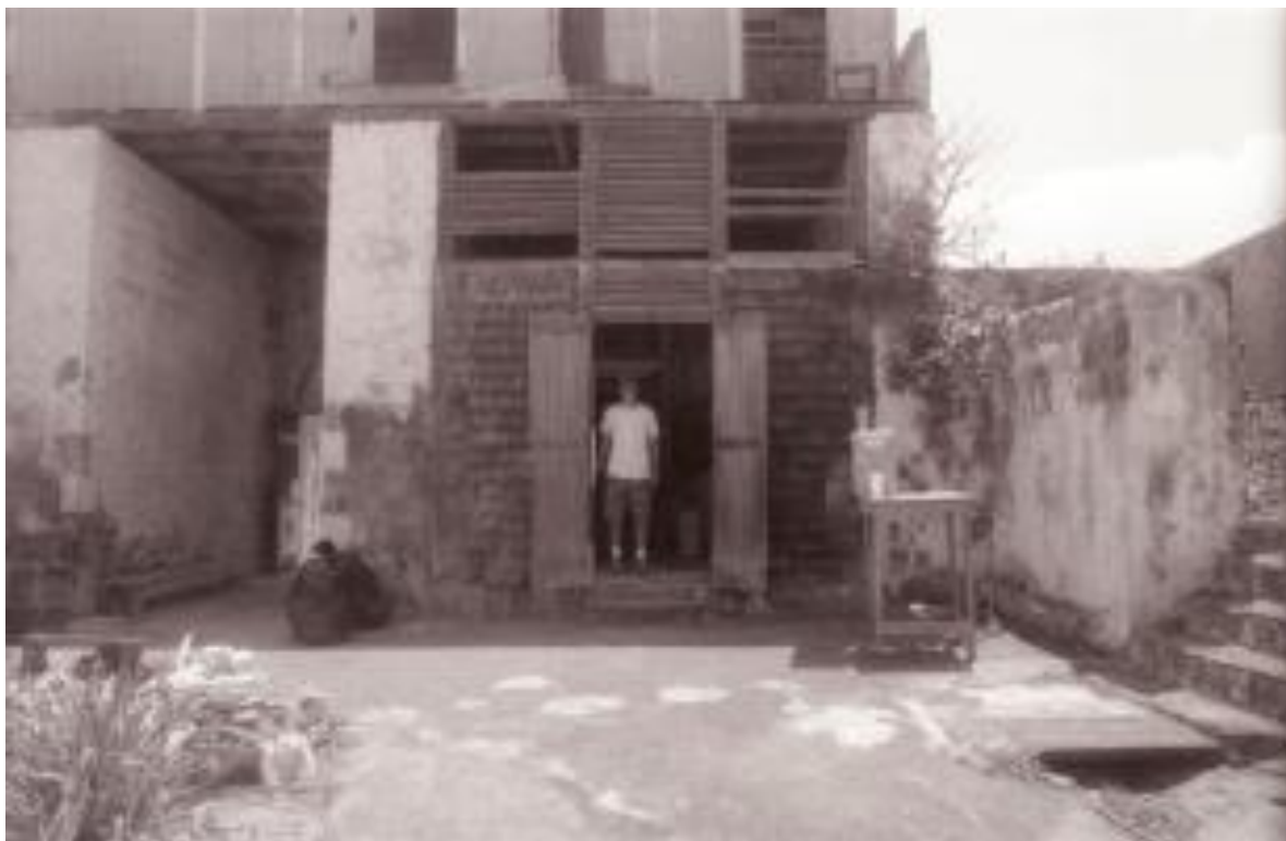
Figure 21.—Structure 6, Guard House/Asylum Storage building, west elevation, fort's primary entrance passage to the left, stone retaining wall to right and stairs accessing Structures 7 and 11.