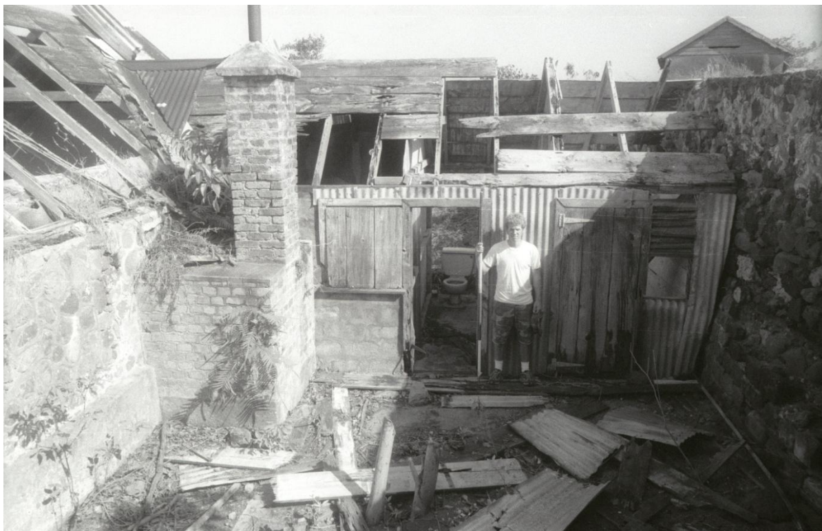
Figure 19.—Structure 4, Kitchen, south elevation, showing chimney and wood bathroom addition, roof of Structure 3 in background.