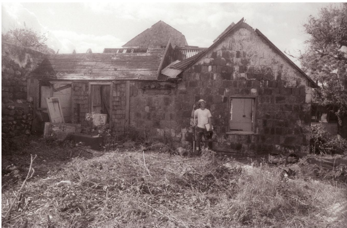
Figure 16.—Structure 4, Kitchen, north elevation, wood addition and east defensive wall to the left.