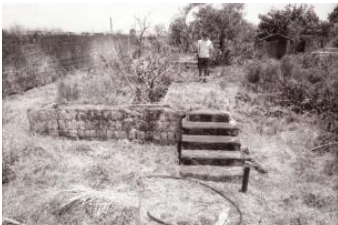
Figure 60.—Structure 21, Stone Foundation, north elevation.