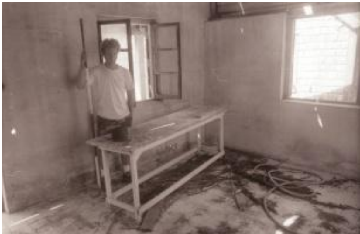
Figure 32.—Structure 9, Clinic, interior of examination room and examination table, view to the west-southwest.