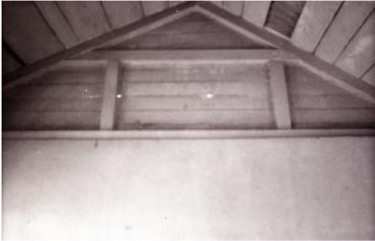
Figure 47.—Structure 14, Patient living Quarters, showing interior architecture of roof construction (contrast with Figure 43).