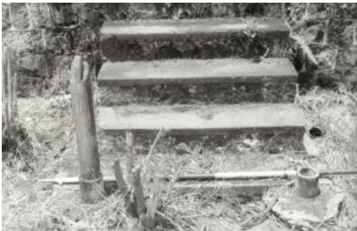
Figure 55.—Structure 18, Patient Living Quarters, detail of stairs and handrail supports.