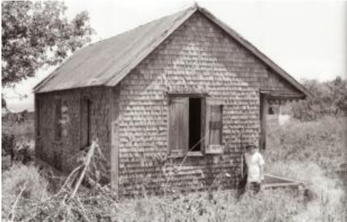
Figure 53.—Structure 18, Patient Living quarters, southwest perspective.