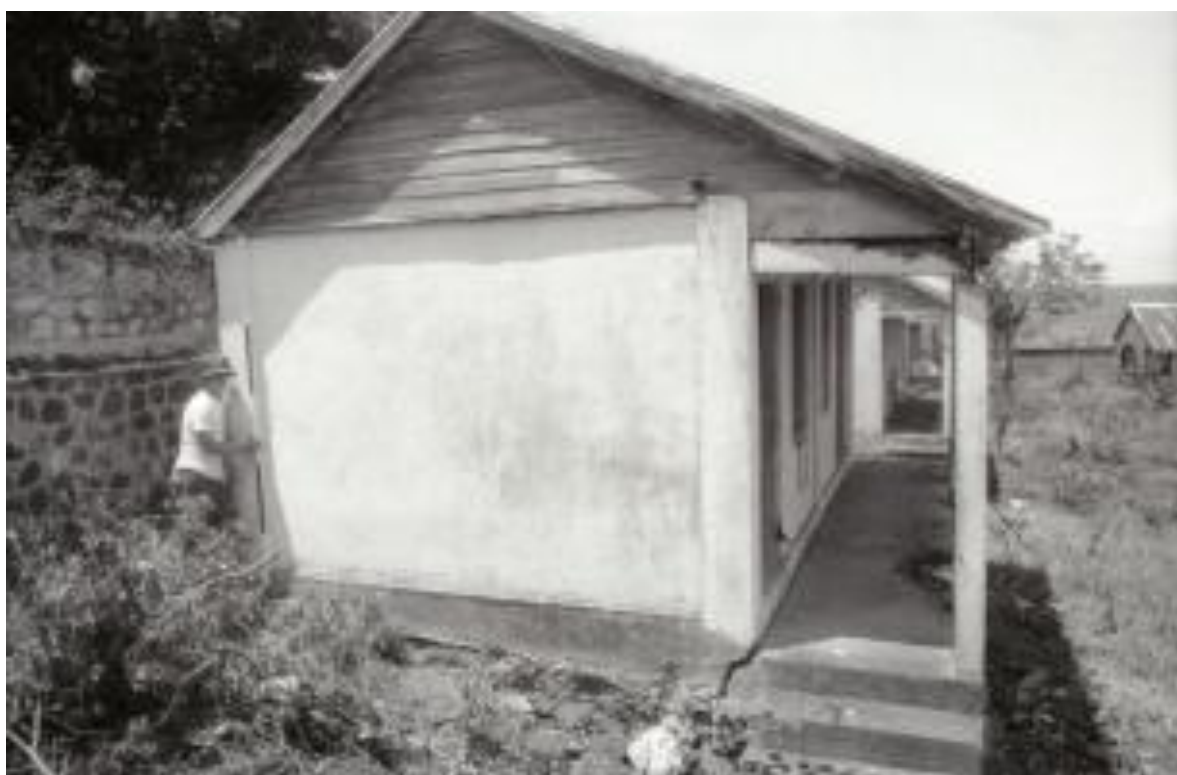
Figure 46.—Structure 13, Patient Living Quarters, east elevation.