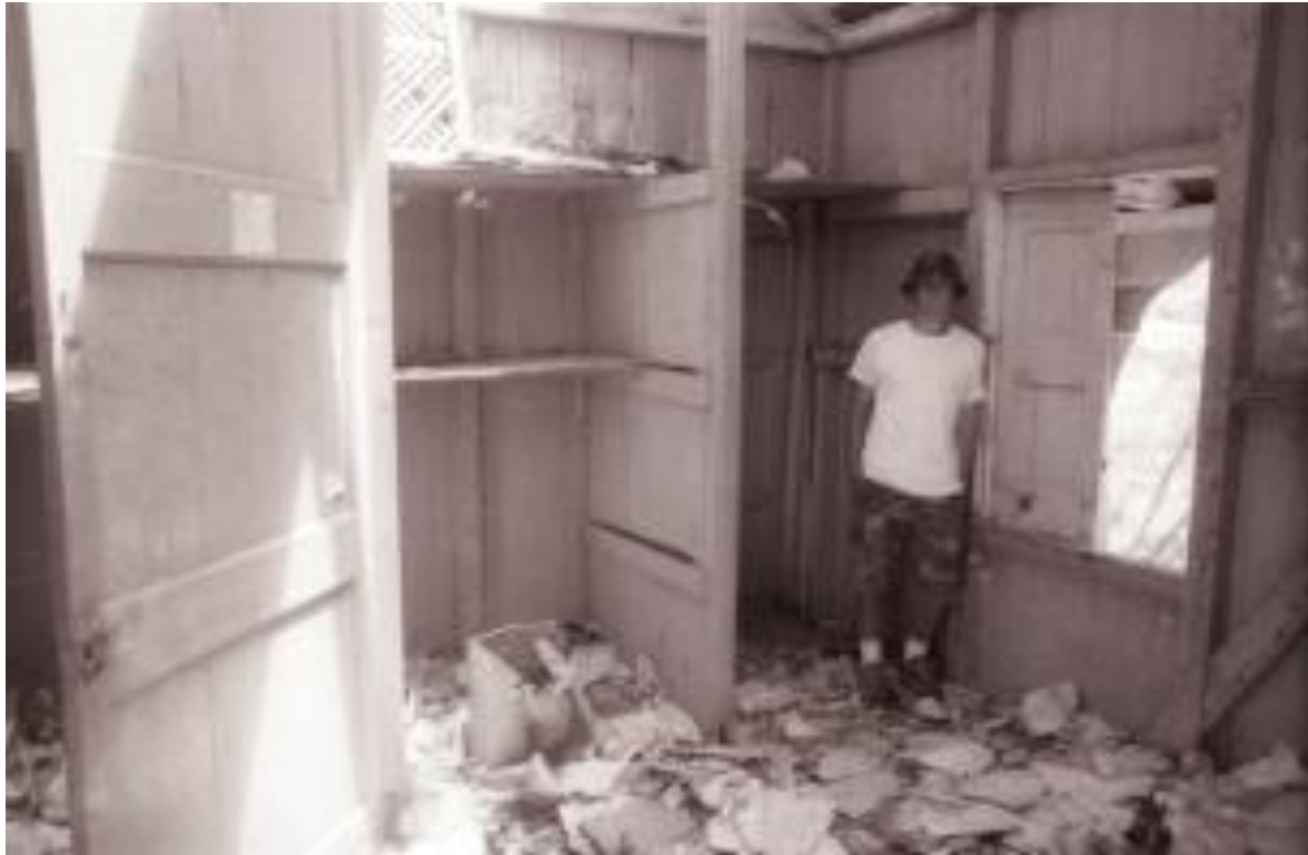
Figure 25.—Structure 7, Administrative Building, interior of office area, view to northeast