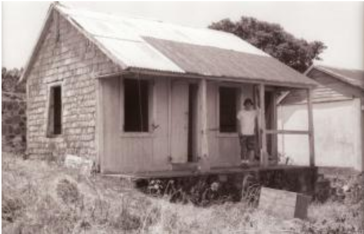
Figure 40.—Structure 12, Patient Living Quarters, northeast perspective.