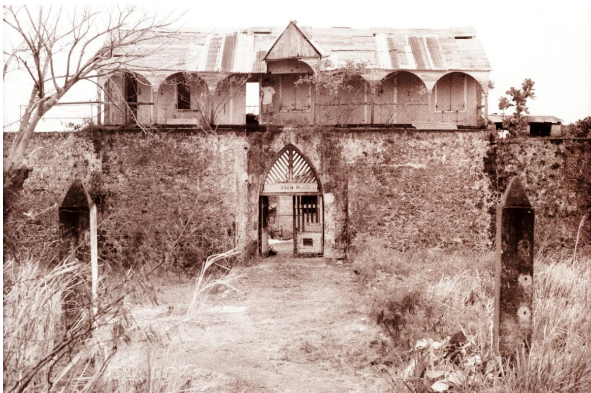
Figure 23.—Charles Fort main gate and Structure 7, Administrative Building, east elevation; concrete gate posts in foreground.