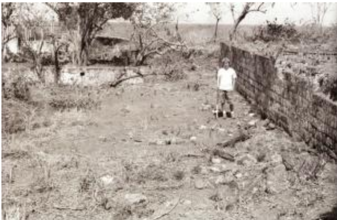
Figure 80.—Structure 32, Stone Foundation, view to west, Structure 31 in rear, wall of Structure 33 at right.