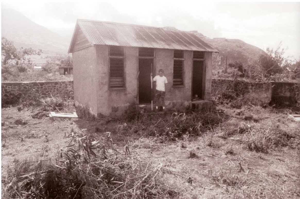
Figure 15.—Structure 3, Detention Building, west elevation.