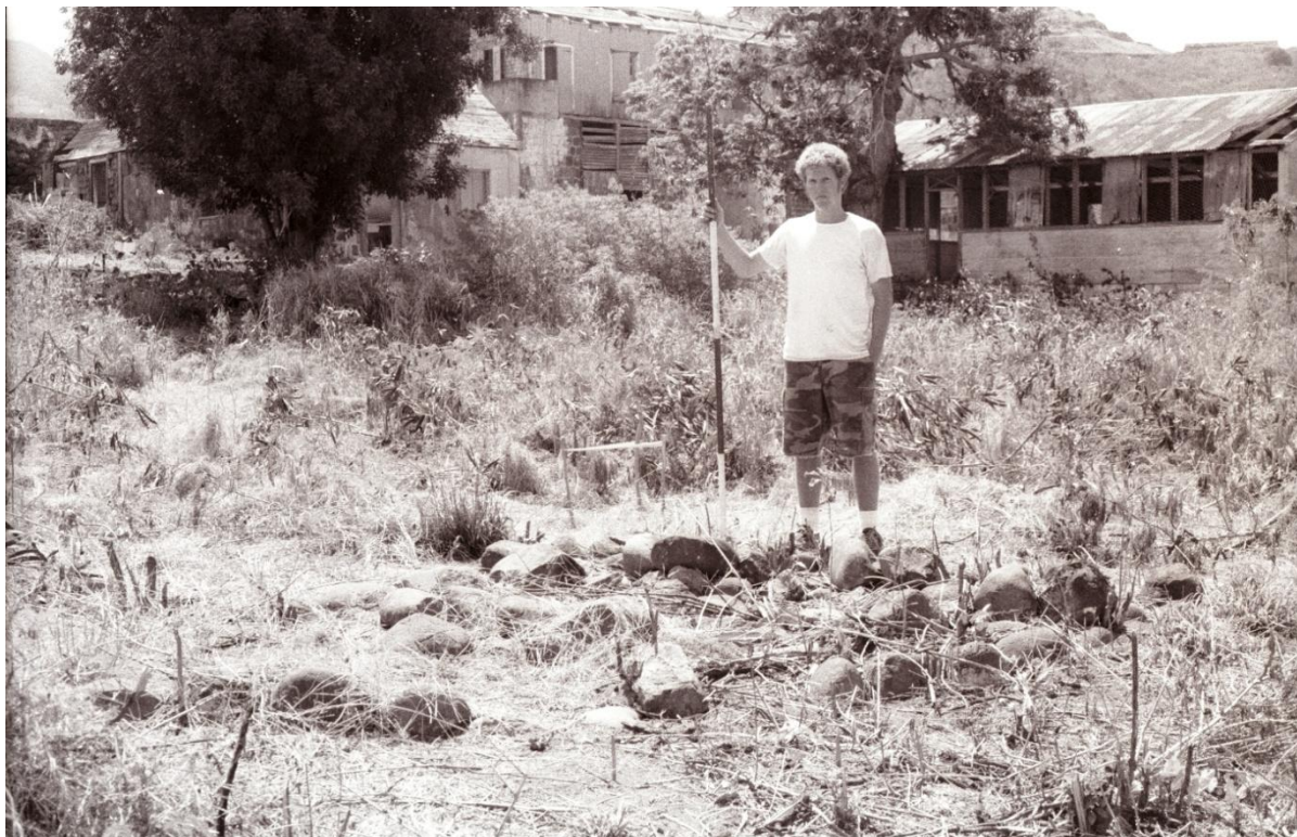
Figure 4.—Rock pattern south of Structures 35 and 36, view southeast, Structures 4, 7, and 8 visible in background (See Figure 2).