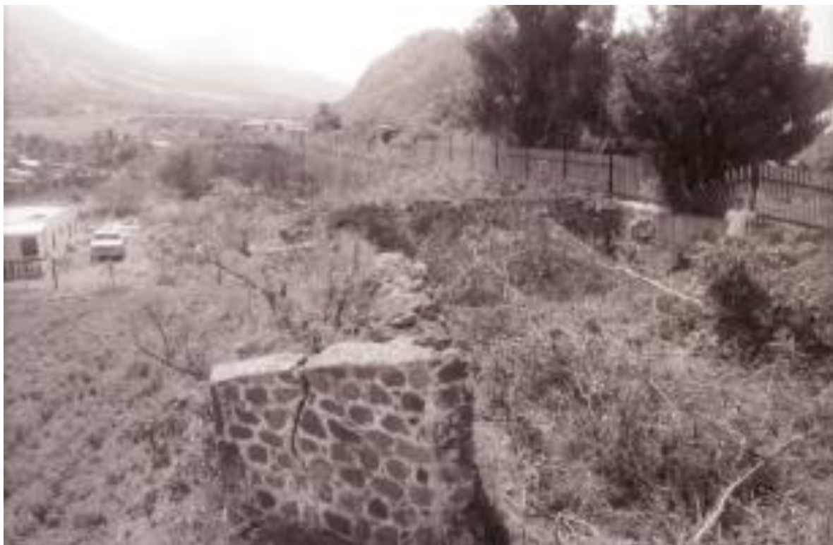
Figure 7.—Northwest Bastion, view east along north defensive wall toward the Northeast Bastion.