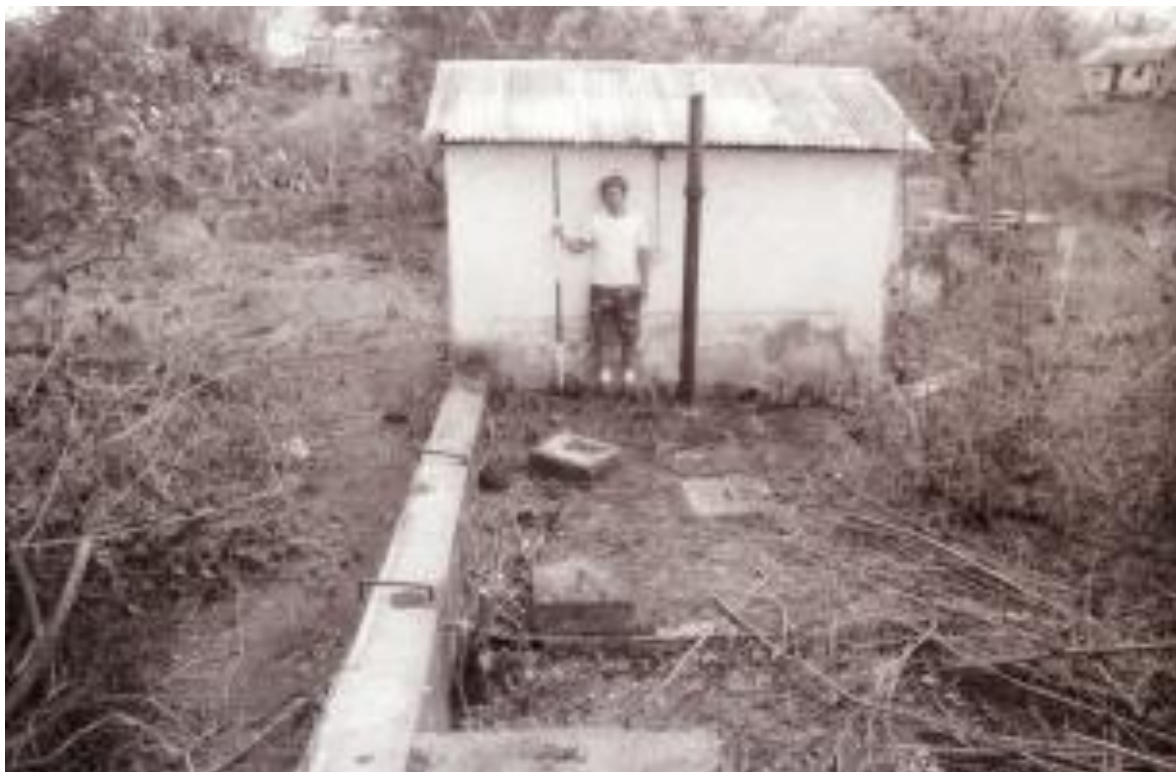
Figure 64.—Structure 24, Bathroom, west elevation and Structure 26, Septic Tank; note exhaust stack; concrete fence foundation attached to Structures at the left.