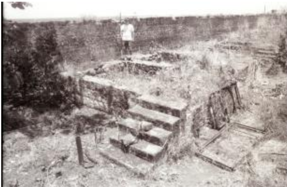
Figure 57.—Structure 19, Stone Foundation, southeast perspective.