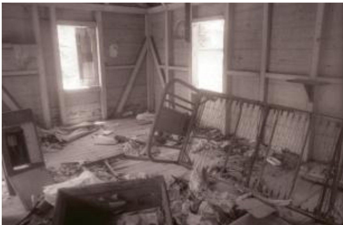
Figure 56.—Structure 18, Patient Living Quarters, interior, view south.