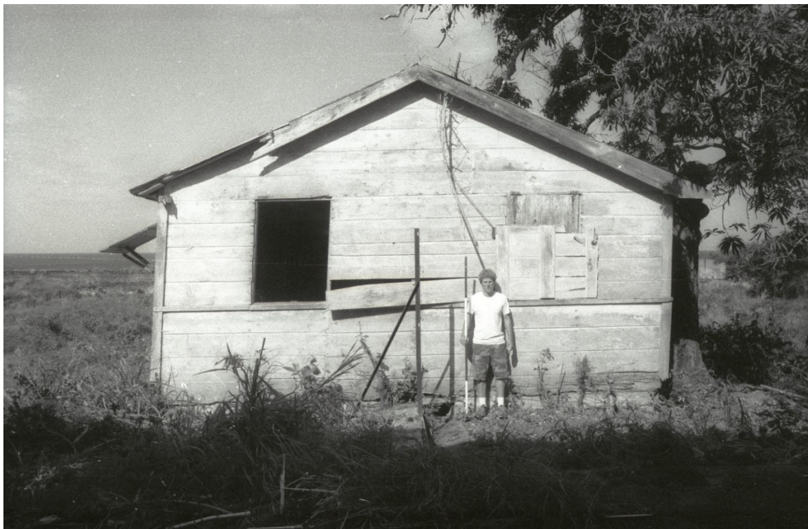
Figure 28.—Structure 8, Assembly Hall, east elevation.