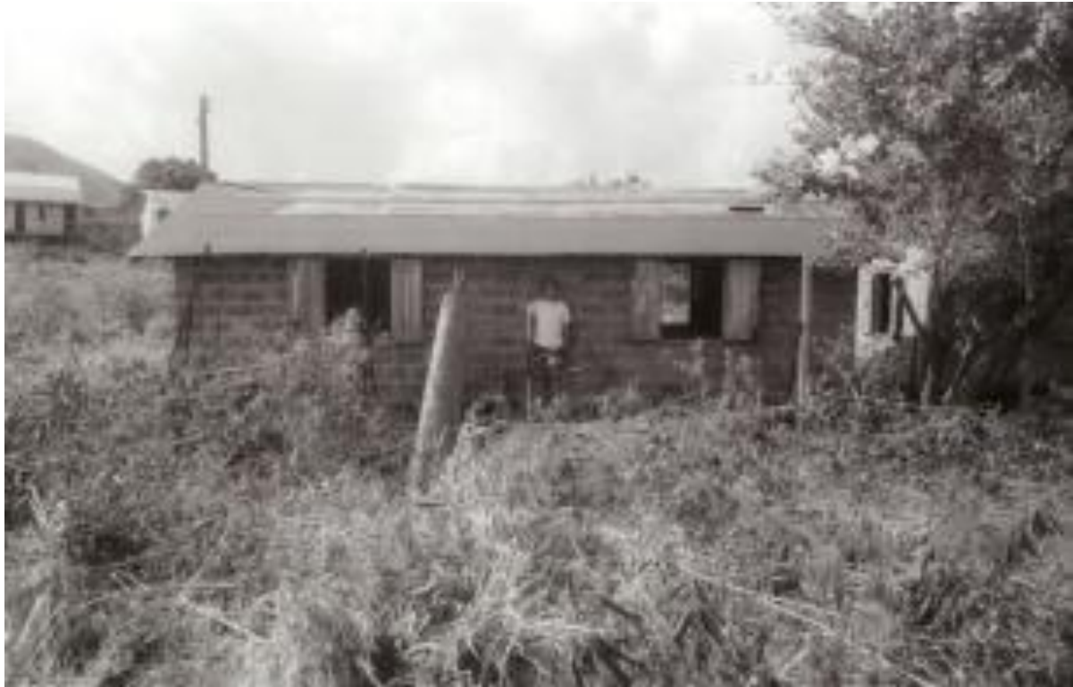
Figure 31.—Structure 9, Clinic, north elevation