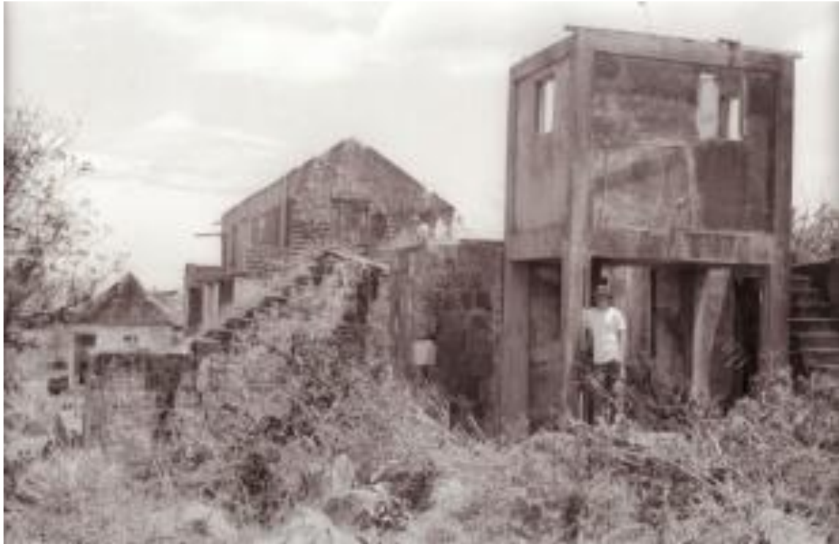
Figure 39.—Structure 11, Nurses and Orderlies Living Quarters, showing concrete bathroom addition, south elevation.