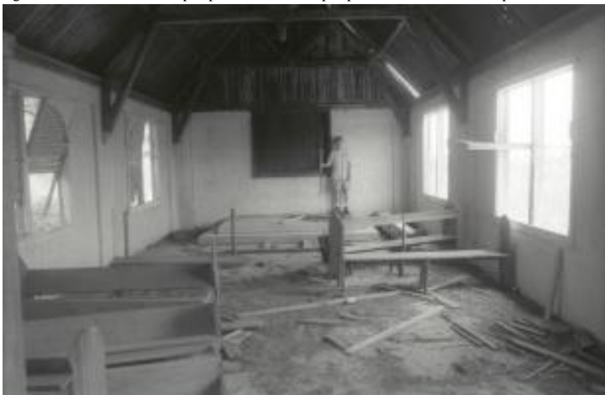
Figure 96.—Structure 38, Chapel, interior looking toward altar, view to south; note roof construction and remains of benches.