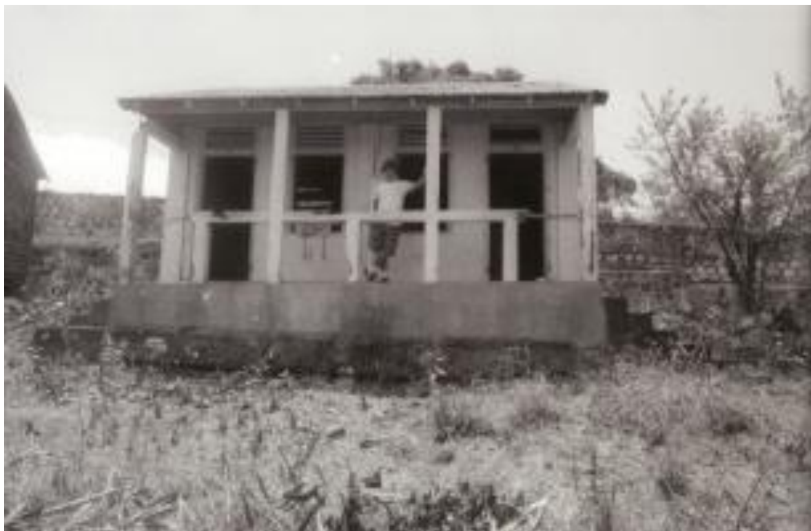
Figure 45.—Structure 13, Patient Living Quarters, north elevation.