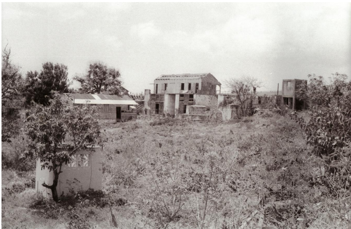
Figure 11.—Overall view of eastern area of the fort's interior, Structure 17 (foreground) and from left to right Structures 8, 5, 7, 6, and 11, view east-northeast.