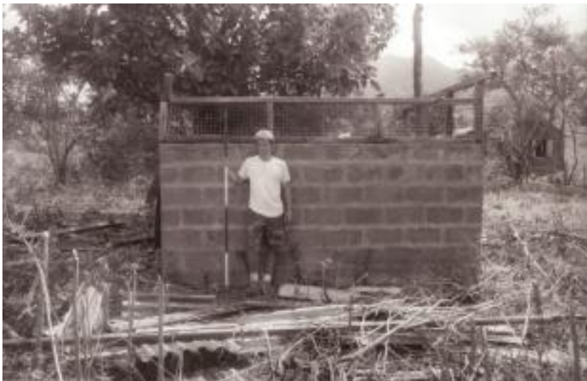
Figure 73.—Structure 28, Bath and Laundry Building ruins, west elevation; note wire mesh ventilation at the top of the wall.