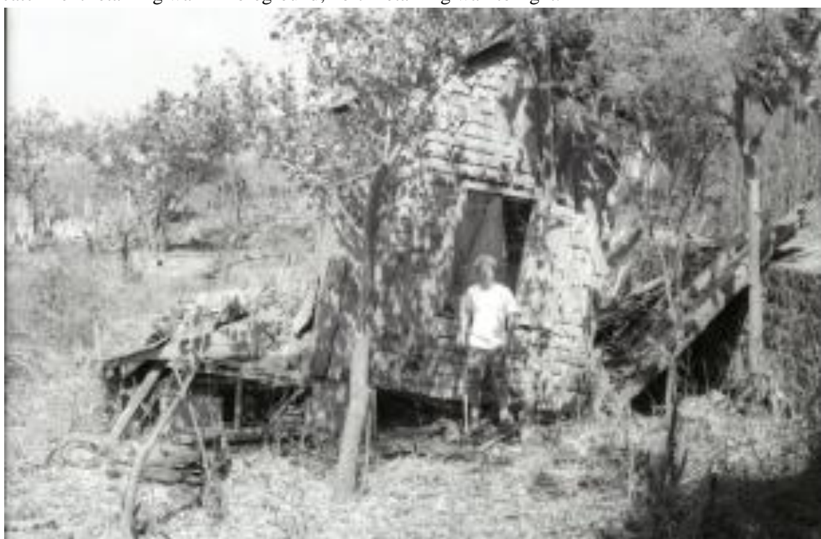
Figure 84.—Structure 34, Patient living Quarters ruins, east elevation; collapsed structure wall rests against north cistern catchment retaining wall.