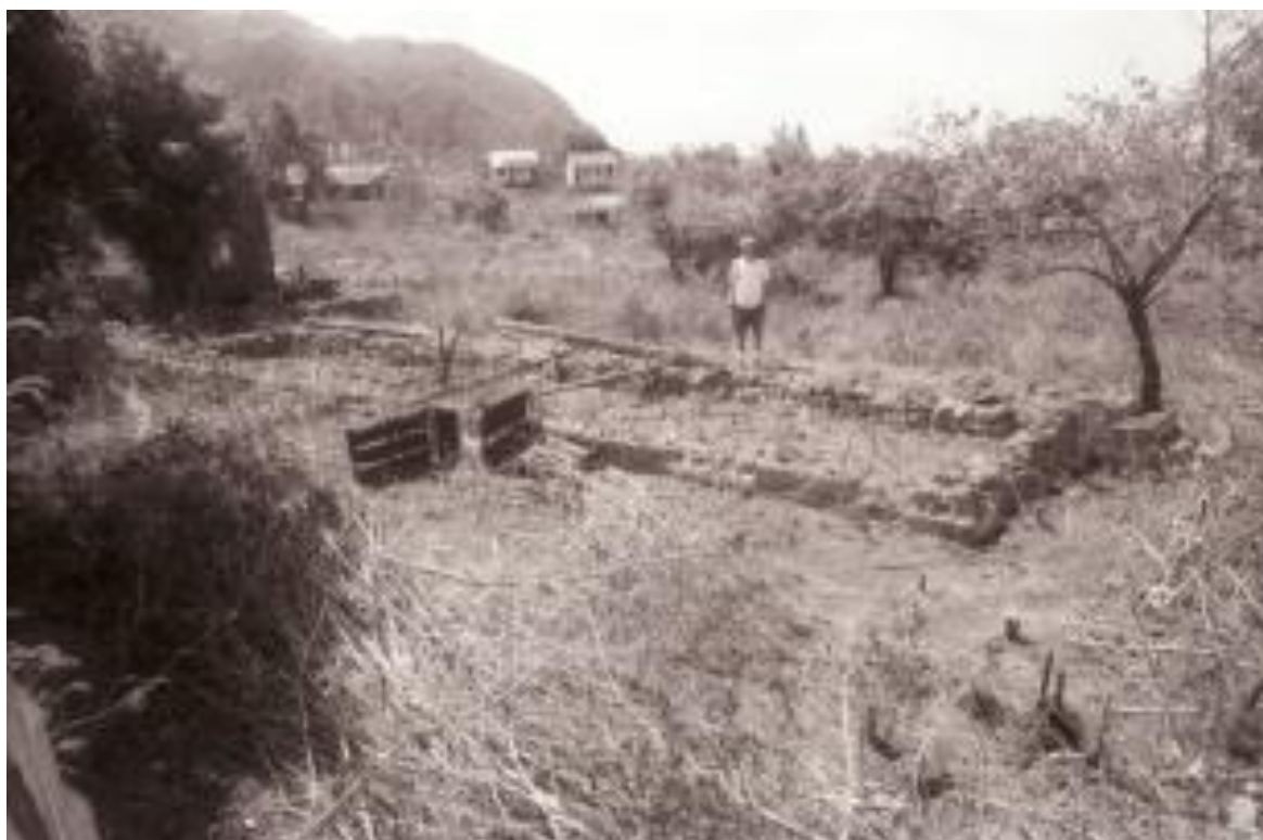
Figure 81.—Structure 33, Stone Foundation, northwest perspective; in the background from left to right are Structures 8, 12, 13, and 9.