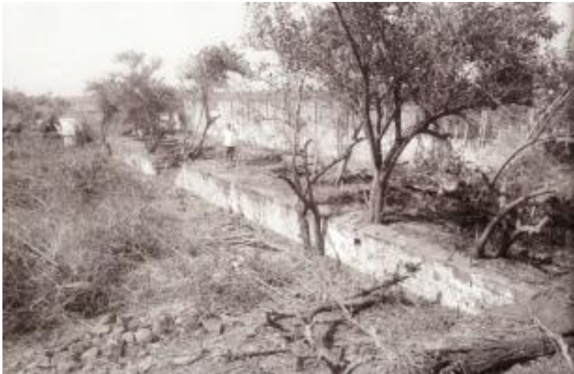
Figure 76.—Structure 30 (rear) and 31 (foreground), Stone foundations, northeast perspective.