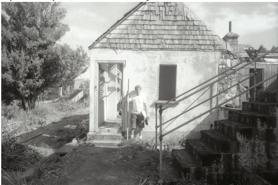
Figure 18.—Structure 4, Kitchen, south elevation of main building, stairs to Structure 7 in foreground, note covered drain left of steps.