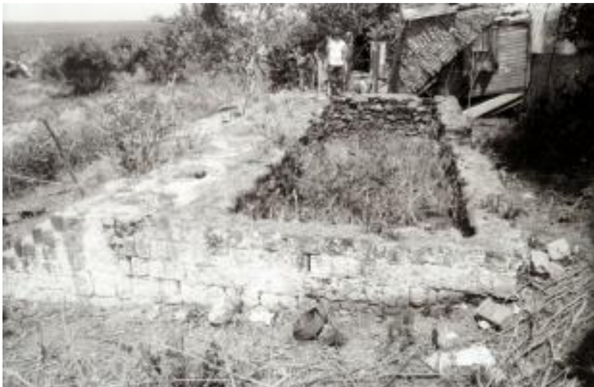
Figure 92.—Structure 37, Library, east elevation; Structure 36 shows in background.