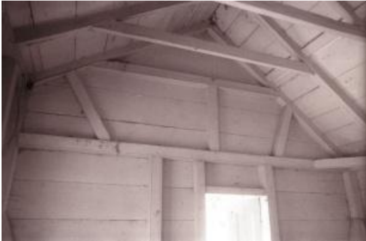
Figure 43.—Structure 12, Patient Living Quarters, showing interior architecture of roof construction (contrast with Figure 47).