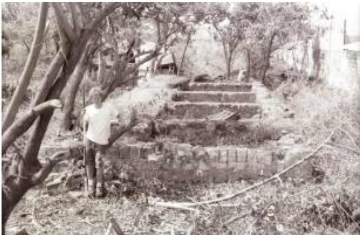
Figure 79.—Structure 30, Stone foundation, north elevation, note interior partitions.