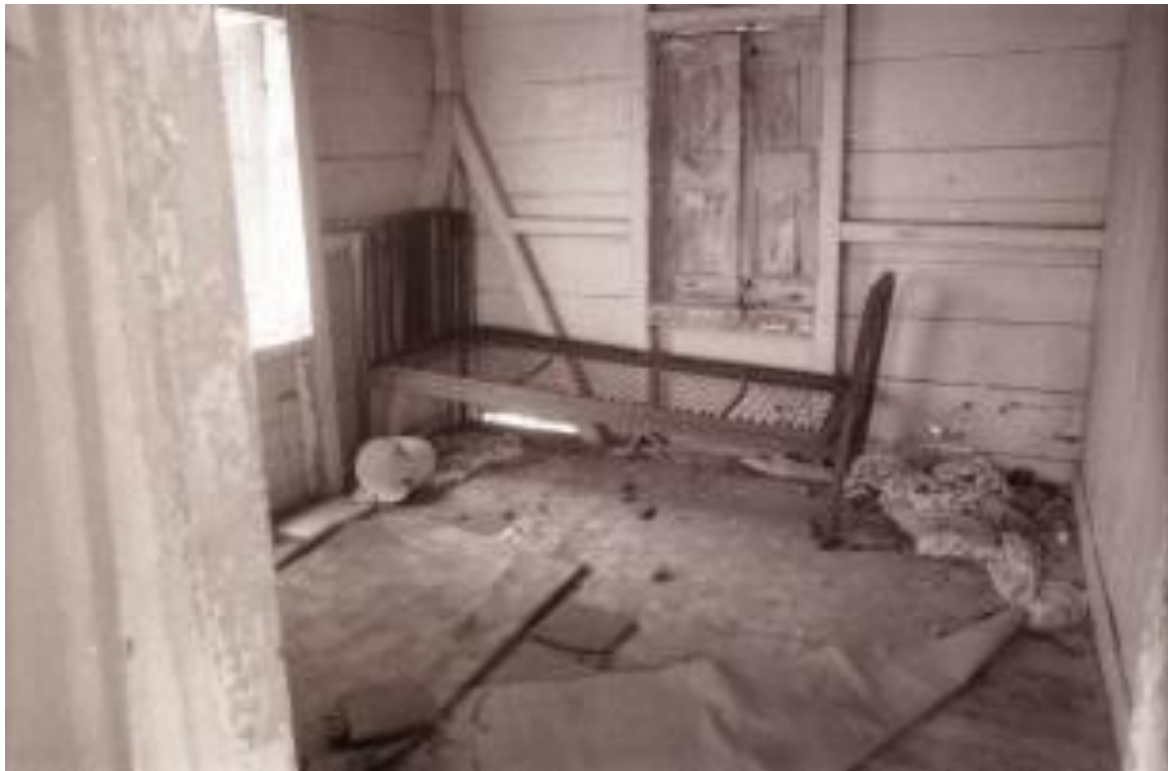
Figure 44.—Structure 12, Patient Living Quarters, interior, view east.