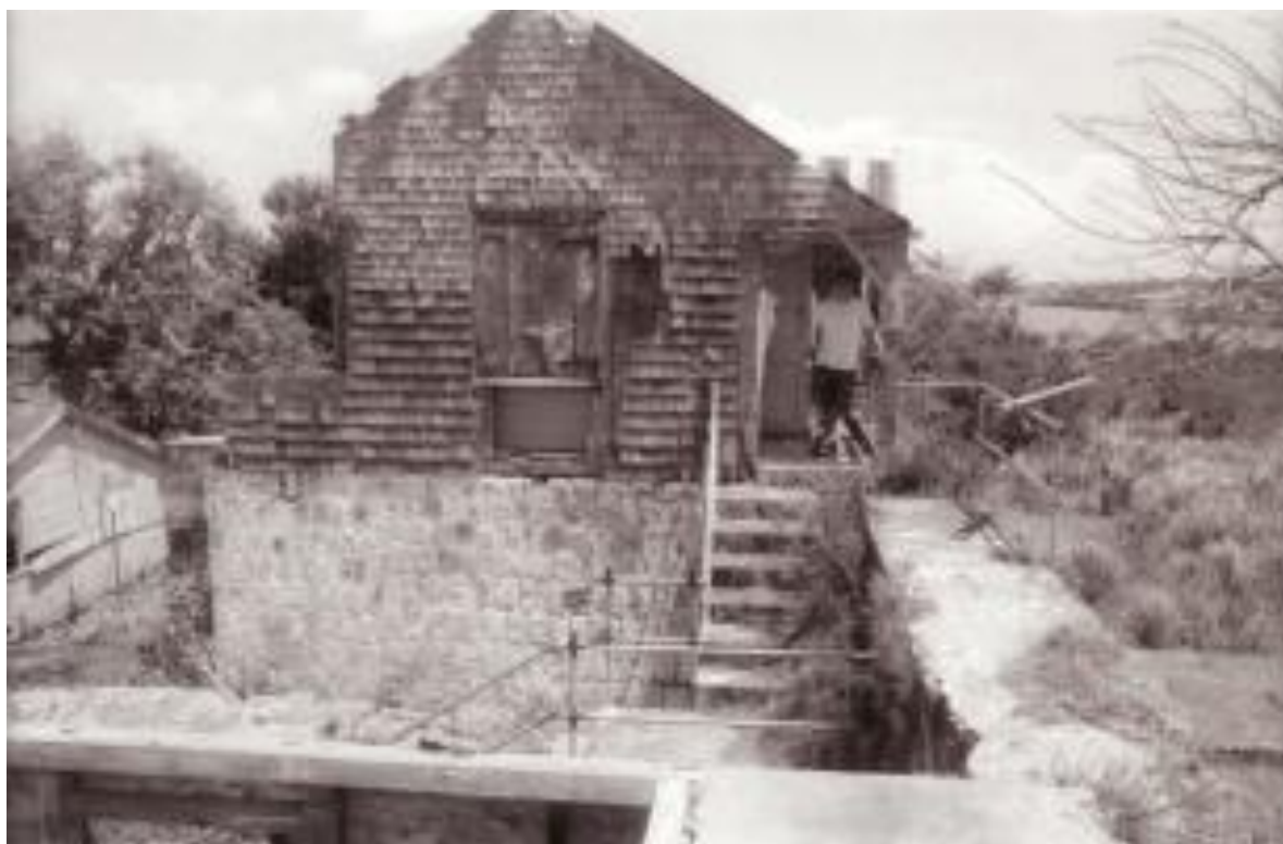
Figure 24.—Structure 7, Administrative Building, south elevation.