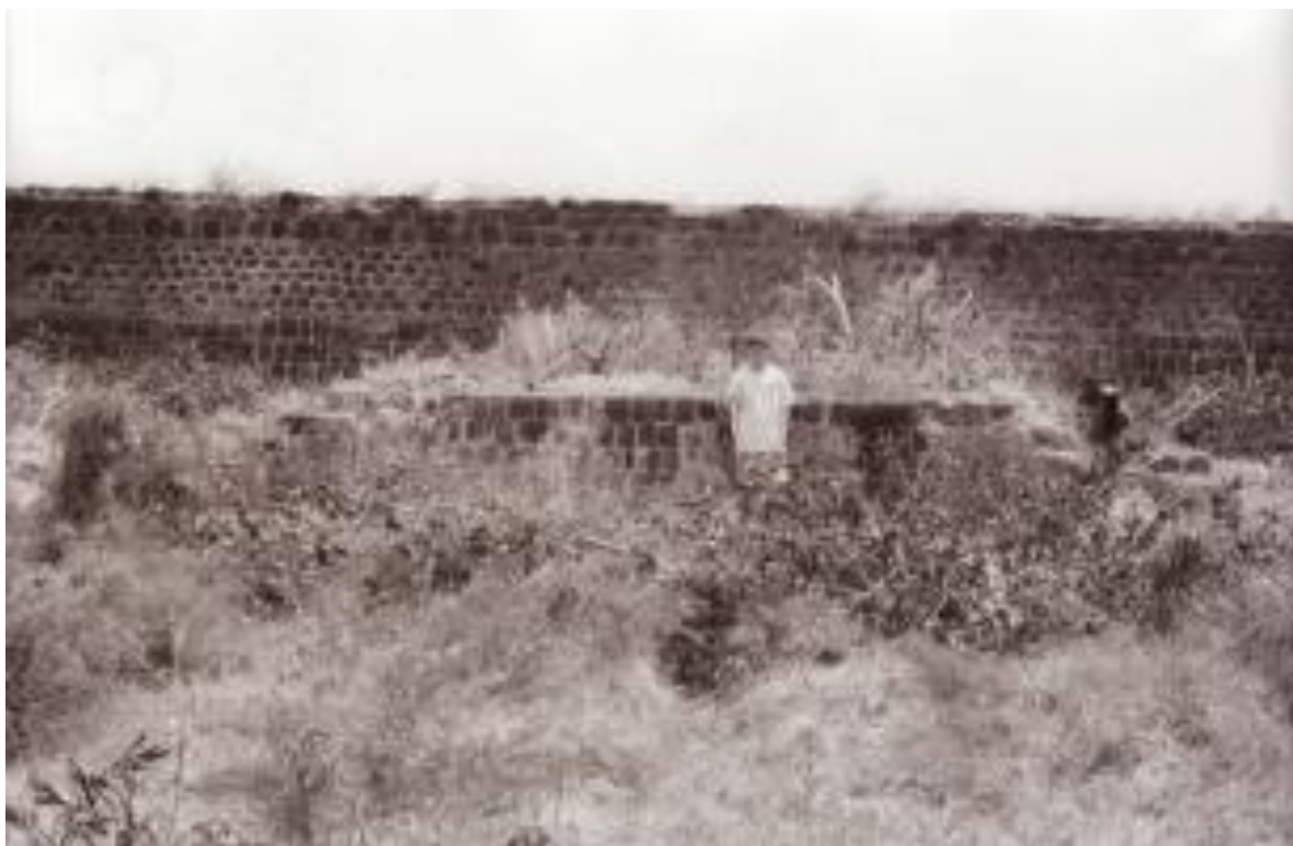
Figure 58.—Structure 20, Stone Foundation, east elevation.