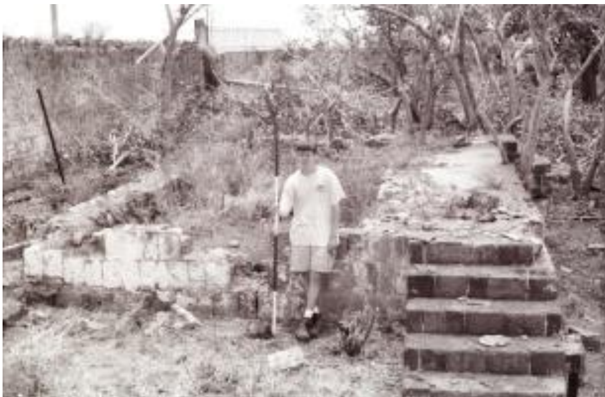
Figure 62.—Structure 22, Stone Foundation, south elevation.