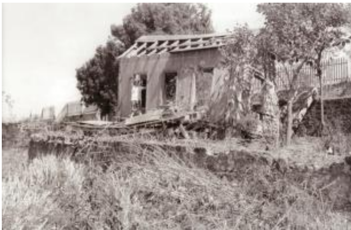
Figure 83.—Structure 34, Patient Living Quarters ruins, south elevation; south cistern (Structure 35) catchment retaining wall in foreground; north retaining wall to right.