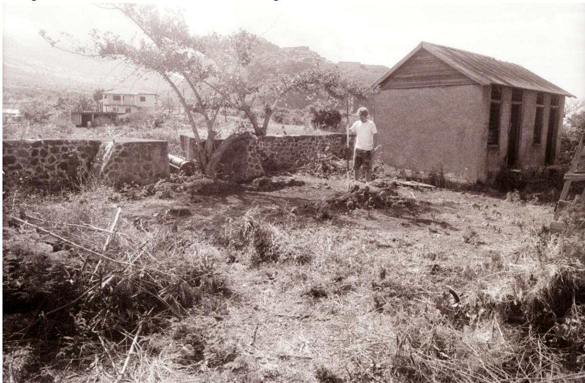
Figure 14.—Structure 2, Stone Foundation, Northeast Bastion wall shows at the right; Structure 3 to the rear, view to the east-southeast.