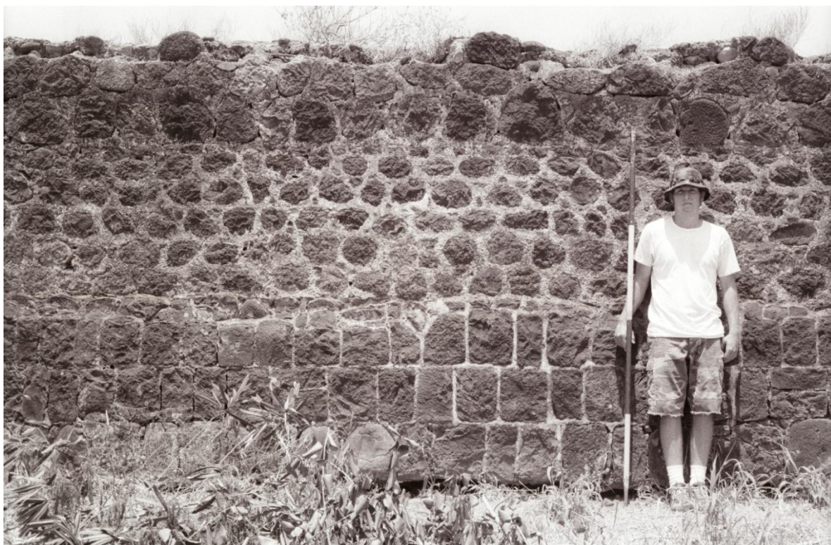
Figure 10.—Interior west defensive wall between Structures 20 and 21, showing masonry pattern of different sized cut stones, view west.