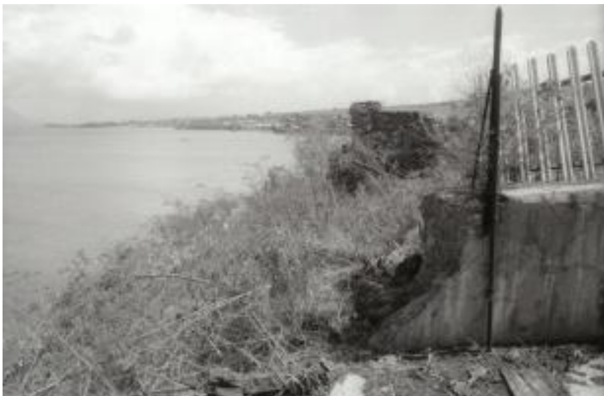
Figure 8.—Northwest Bastion where it is collapsed from erosion, view north.