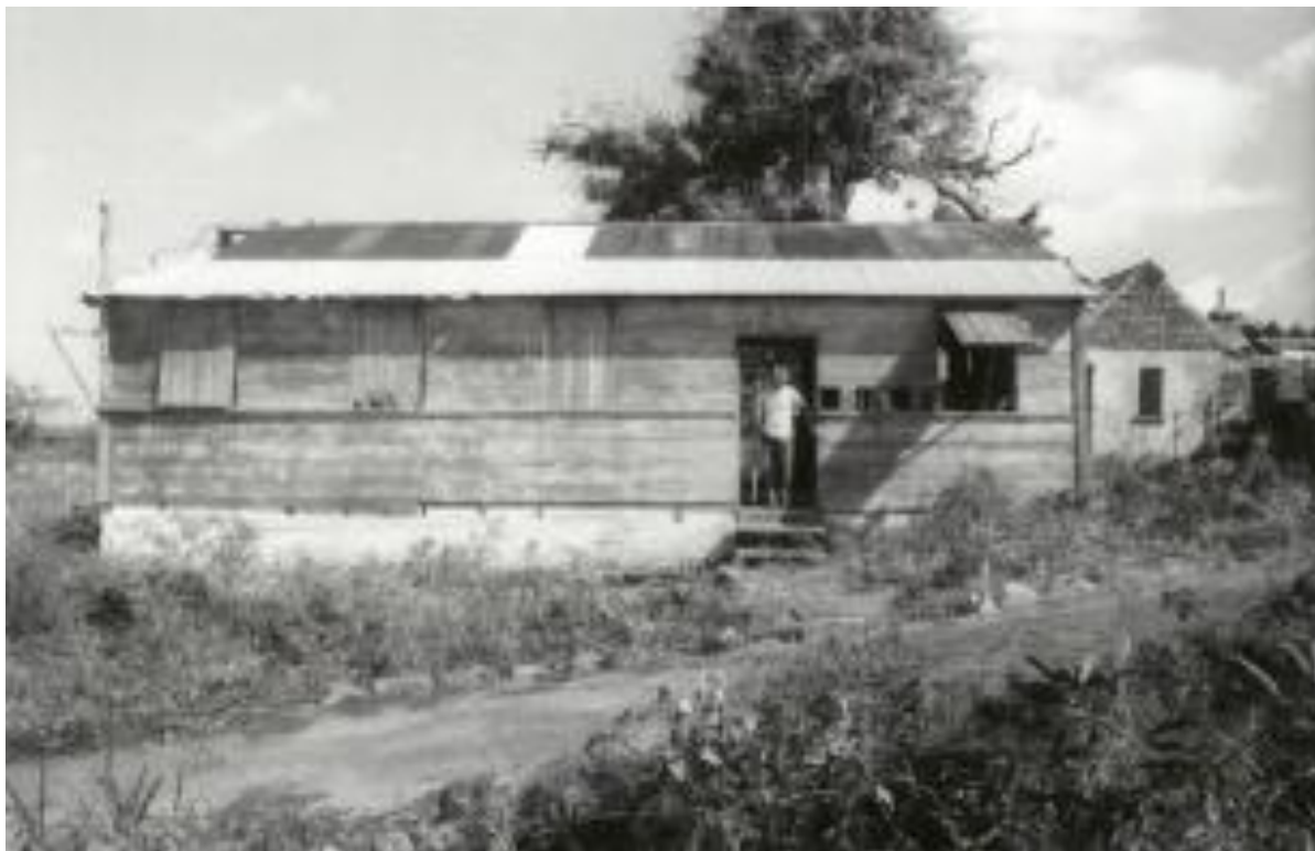
Figure 26.—Structure 8, Assembly Hall, south elevation; Structure 4 shows in rear background.