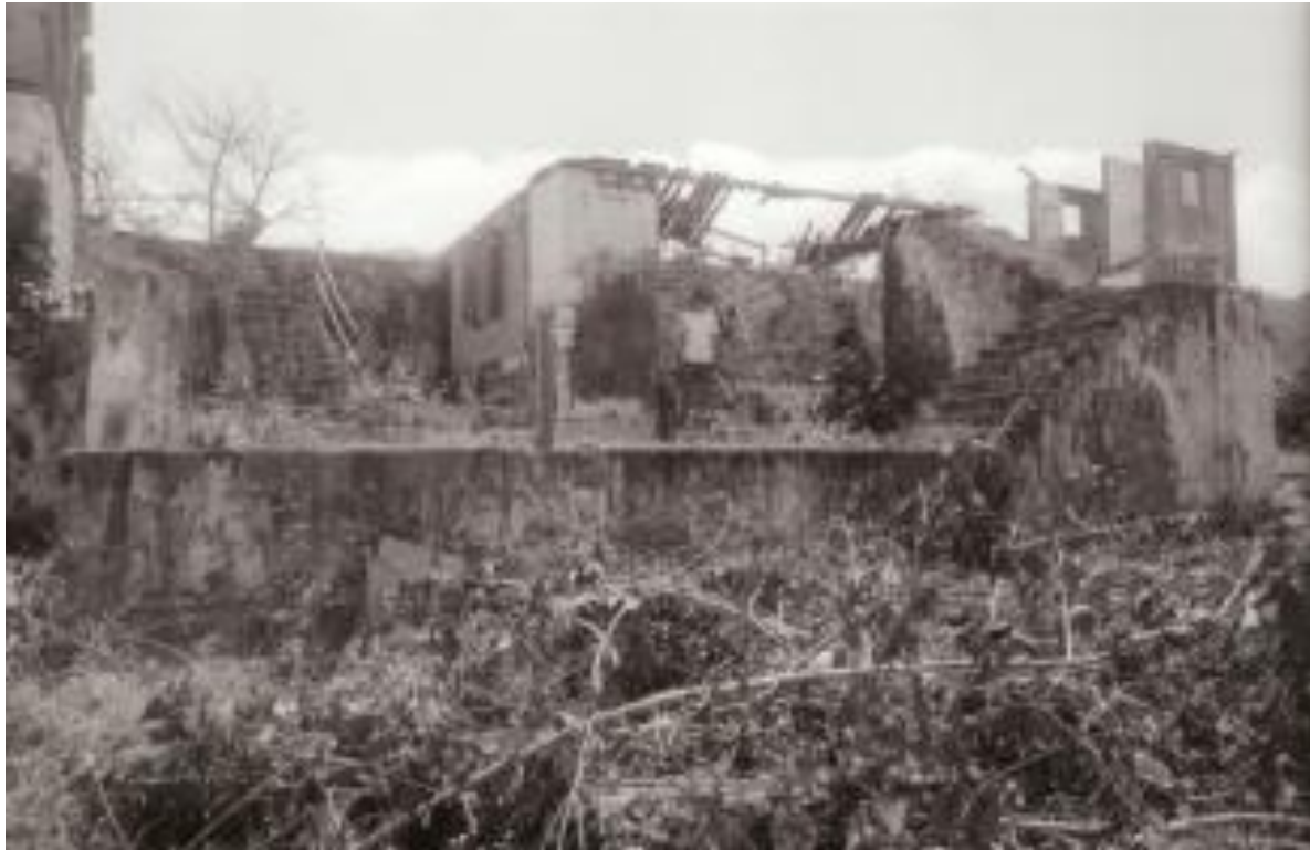
Figure 37.—Structure 11, Nurses and Orderlies Living Quarters, west elevation.