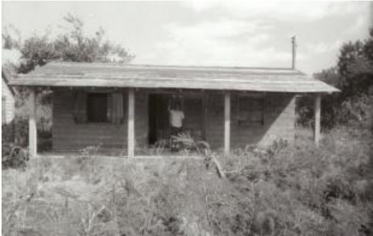
Figure 29.—Structure 9, Clinic, south elevation.