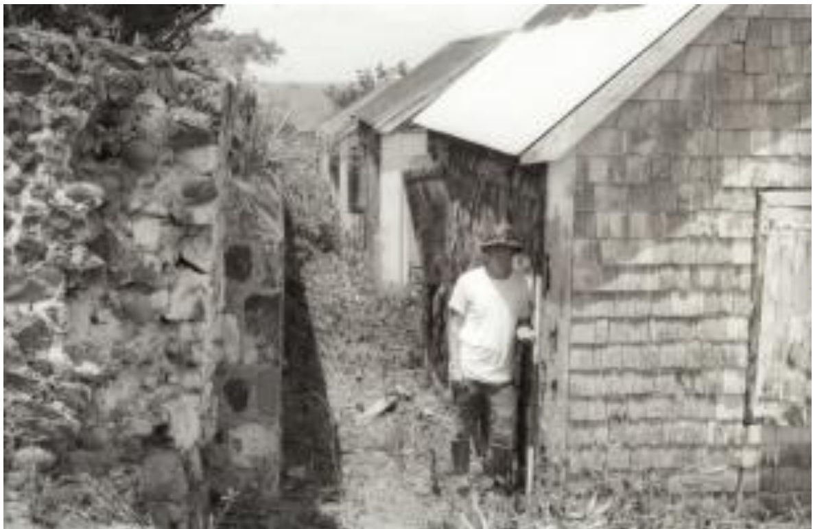
Figure 42.—Structure 12, Patient Living Quarters, showing alignment with Structures 13, 14, and 15, and relationship to south fortress wall.