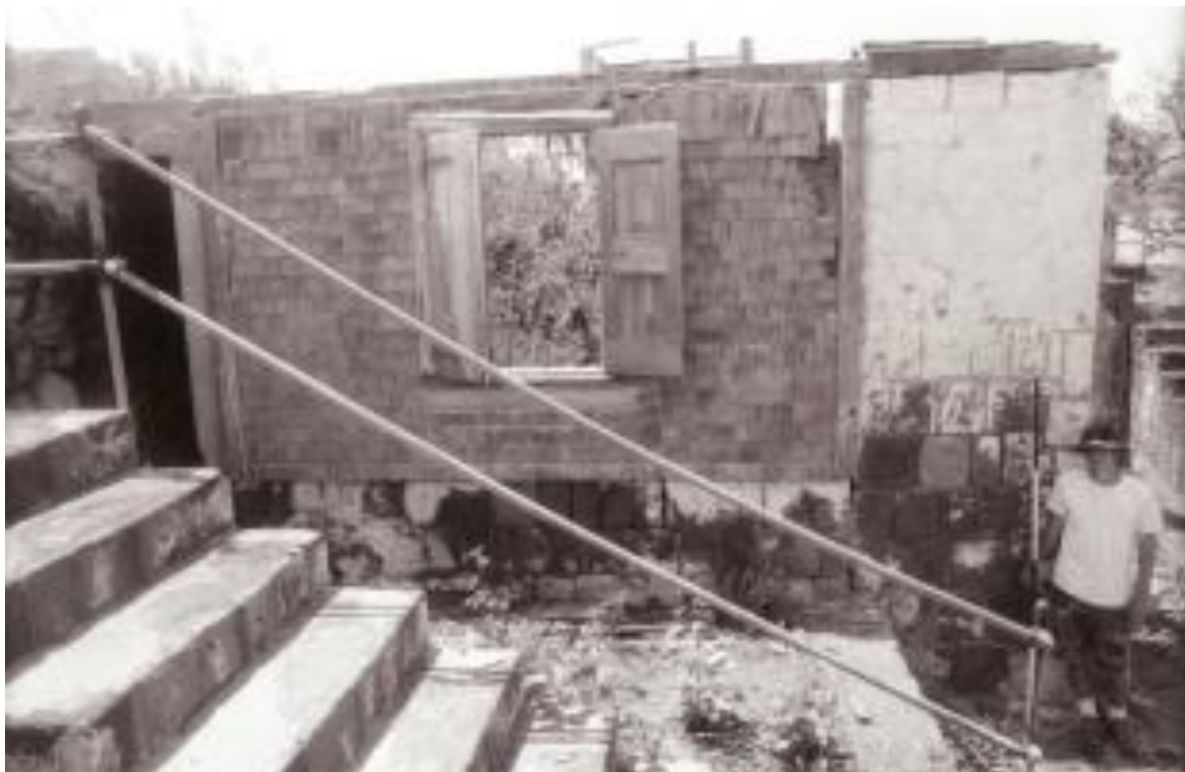
Figure 38.—Structure 11, Nurses and Orderlies Living Quarters, north elevation, stairs to Structure 7 in foreground.