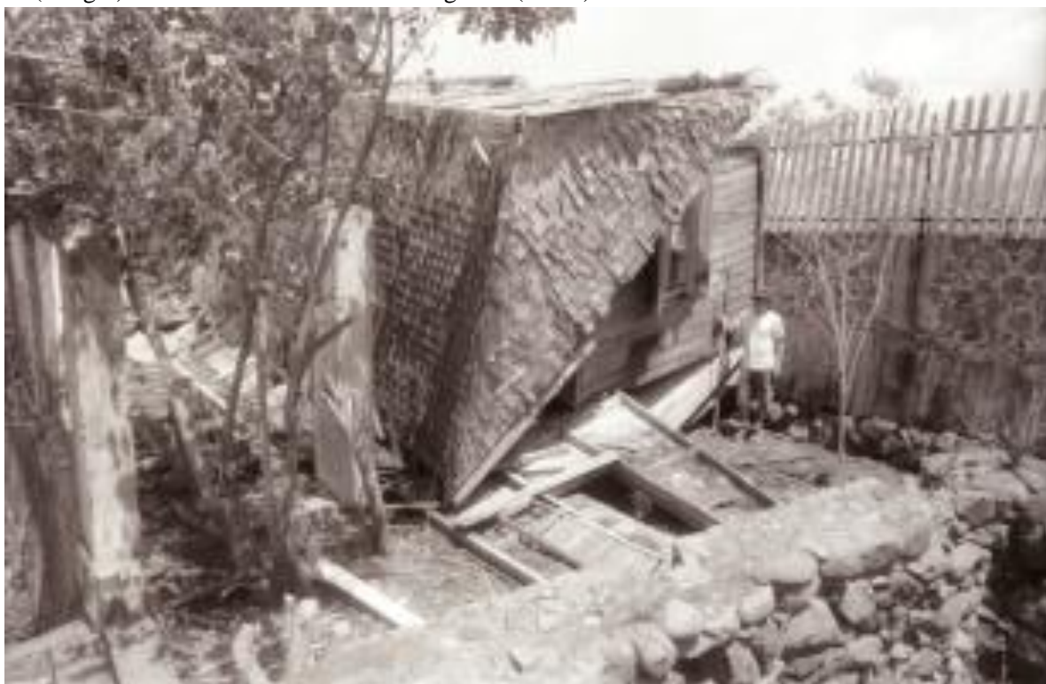
Figure 90.—Structure 36, Patient Living Quarters ruins, east elevation; note relationship to north defensive wall.