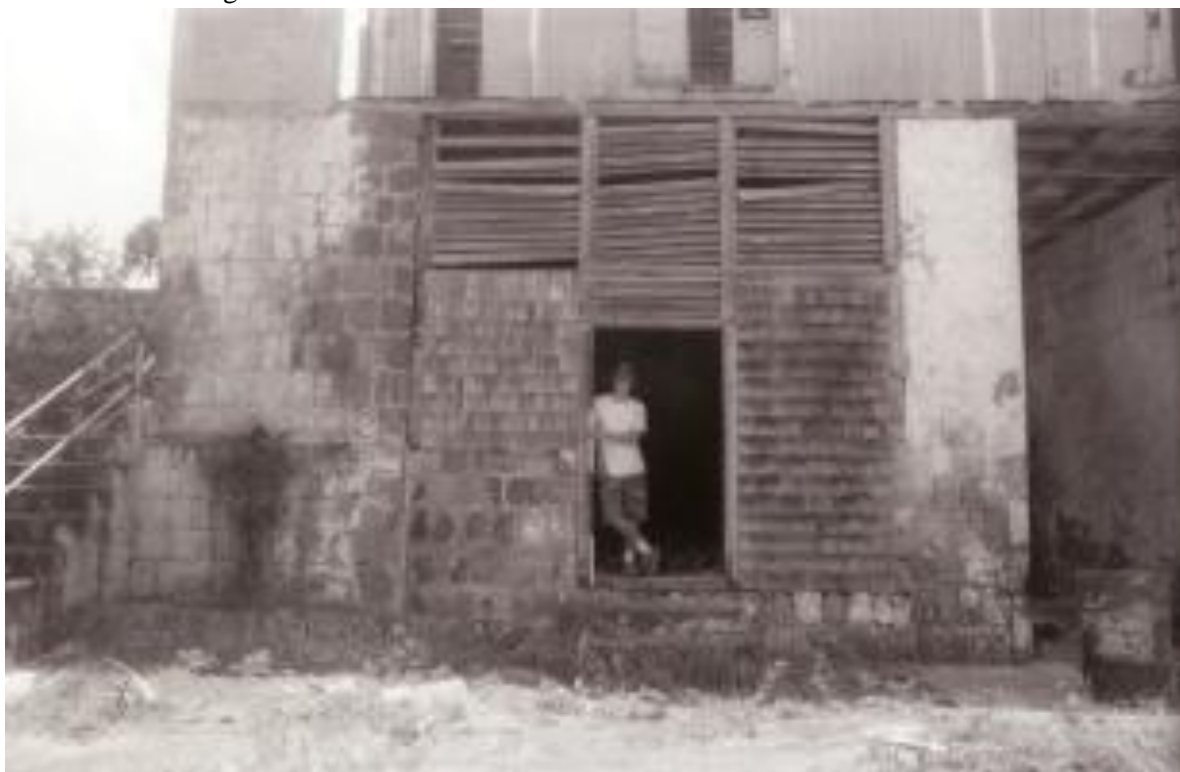
Figure 20.—Structure 5, Guard House/Asylum Storage building, west elevation, fort's primary entrance passage to the right.