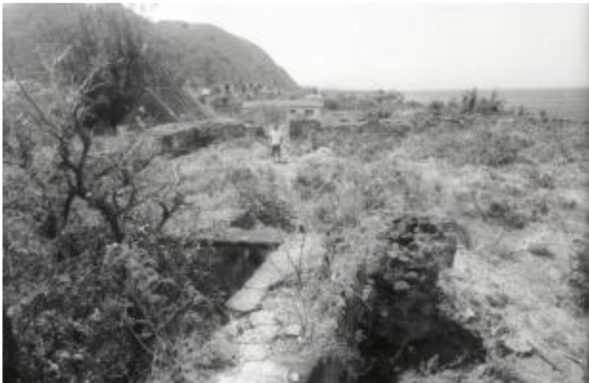
Figure 6.—Interior of the Southeast Bastion, view south