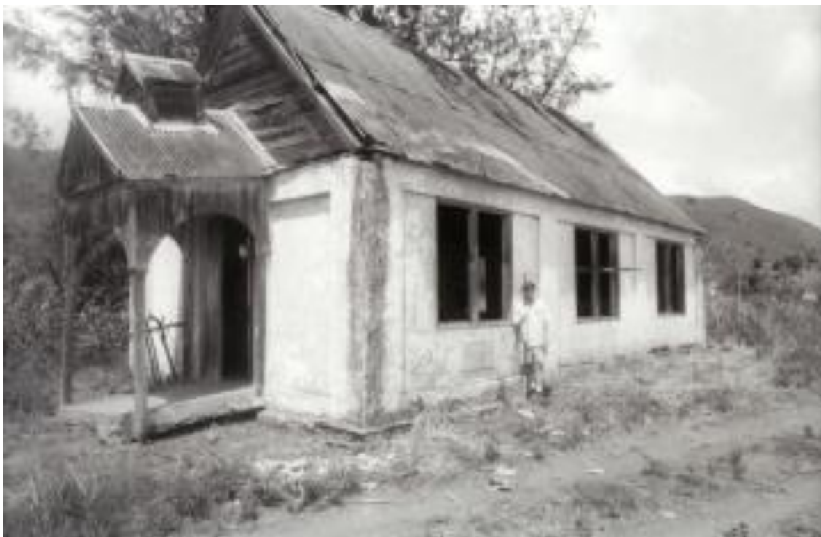
Figure 93.—Structure 38, Chapel, northwest perspective; dedication plaque to left of standing individual.