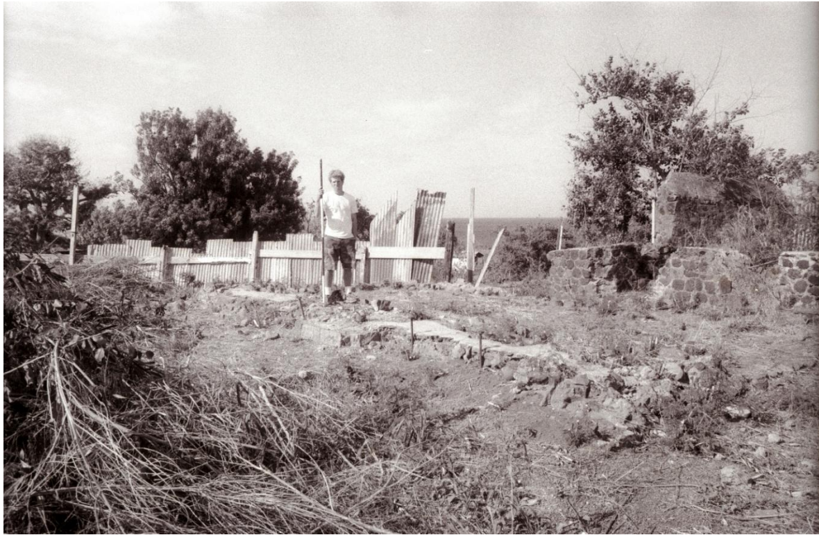
Figure 13.—Structure 1, Stone Foundation, view to the south-southwest, Northeast Bastion wall shows at the right; recent fence shows to the rear (see Figure 100).