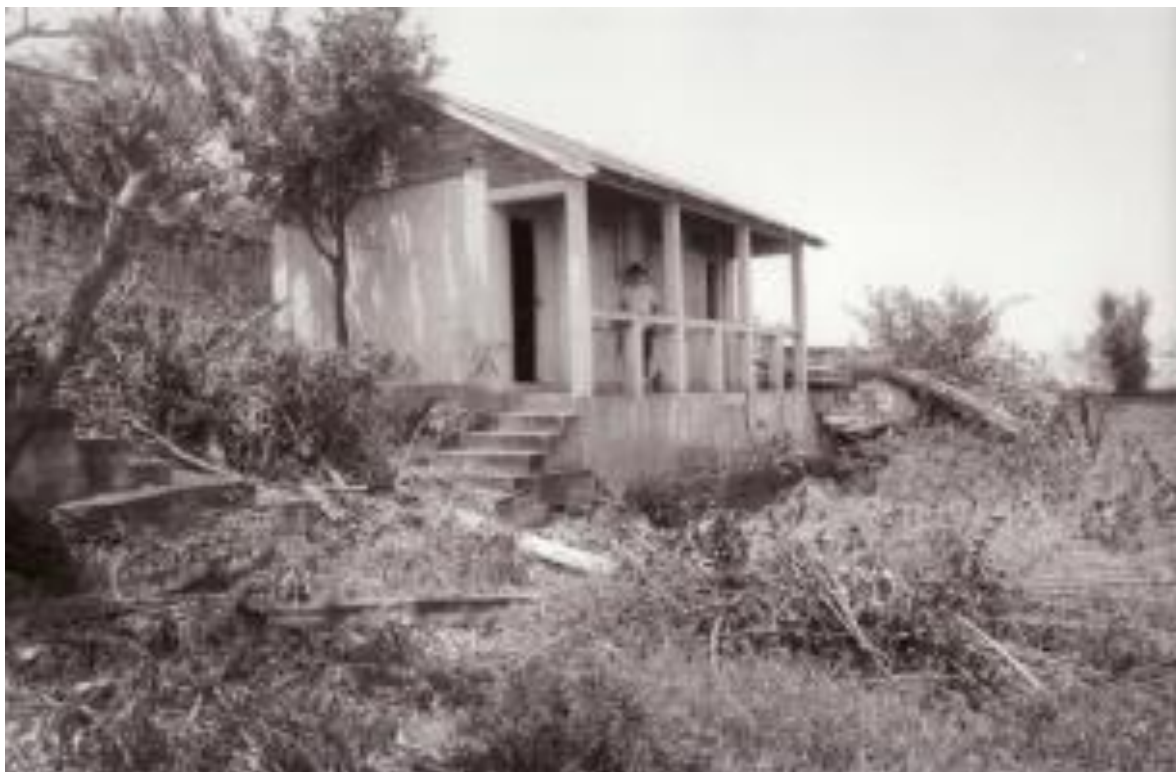
Figure 49.—Structure 15, Patient Living Quarters, northeast perspective.