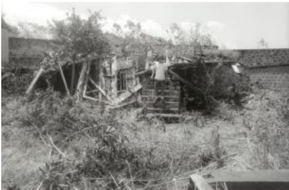
Figure 50.—Structure 16, Detention Building ruins, north elevation, note barred window left of stairway.