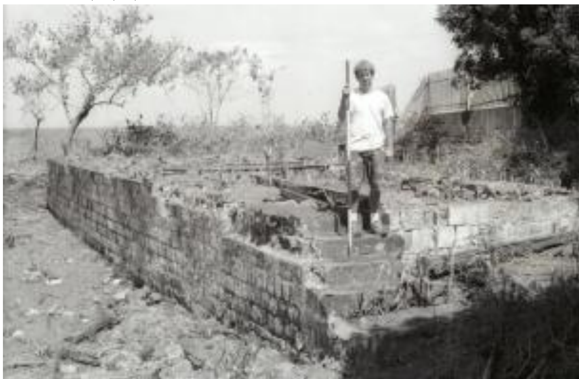
Figure 82.—Structure 33, Stone Foundation, southeast perspective.