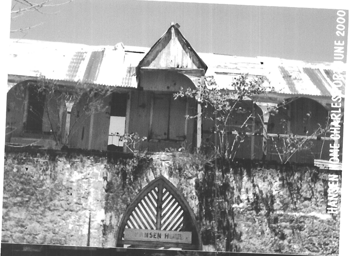
HANSEN HOME CHARLES FOR JUNE 2000