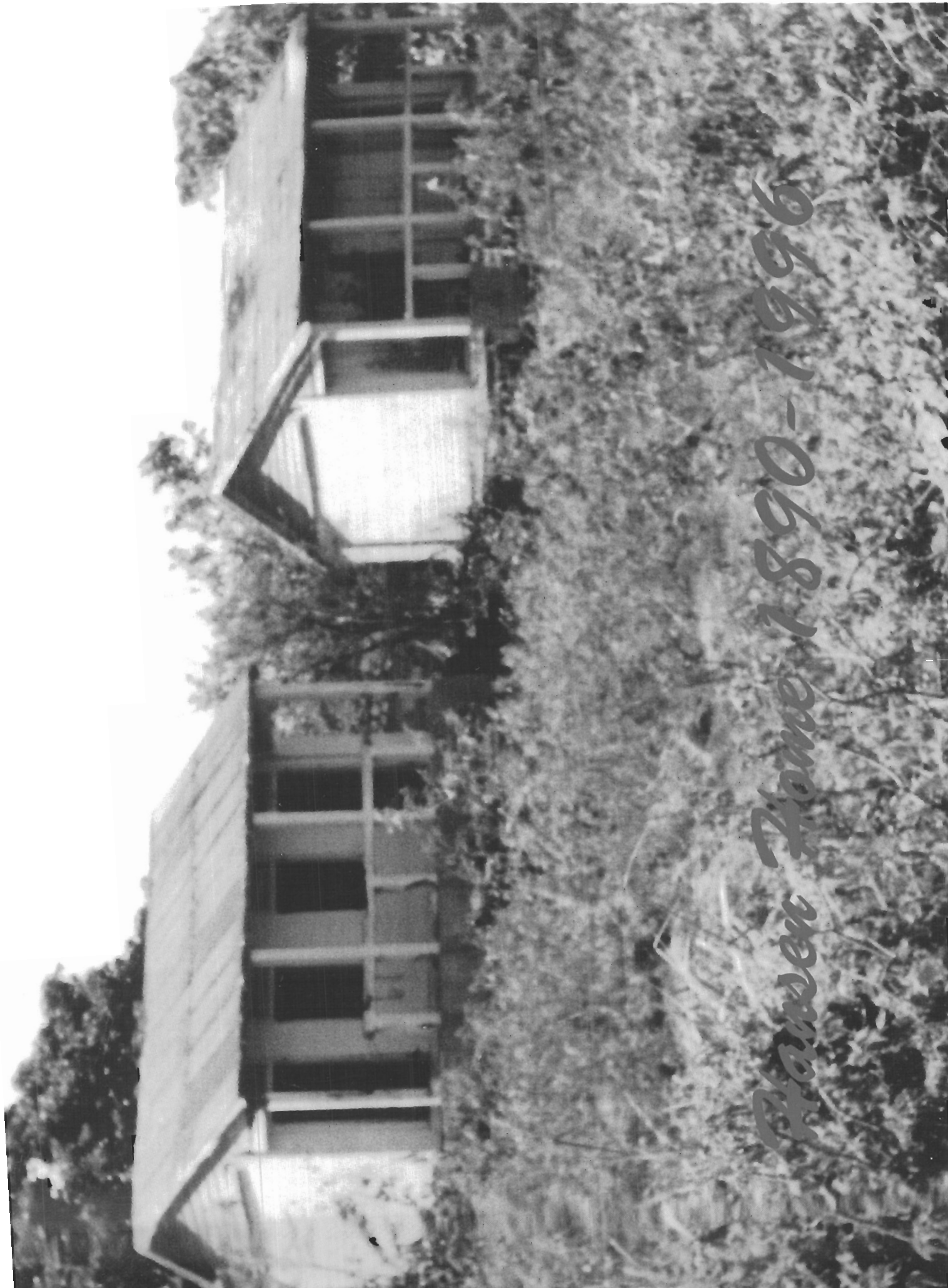
Hansen Home 1890-1996