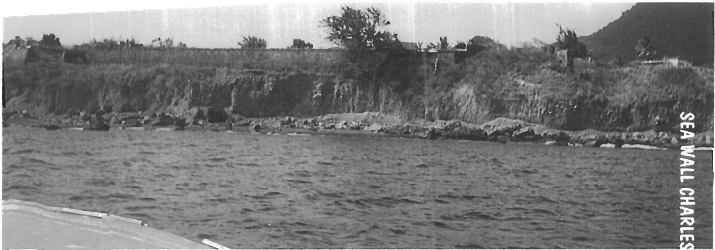
SEA WALL CHARLES